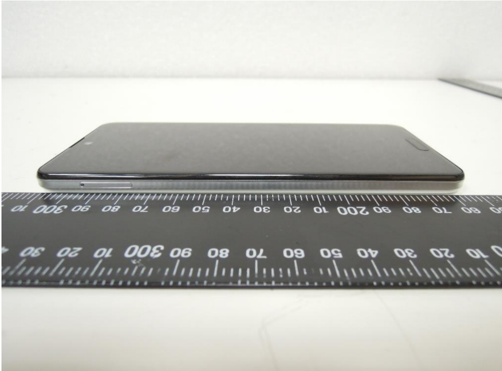
Side View of EUT – 2