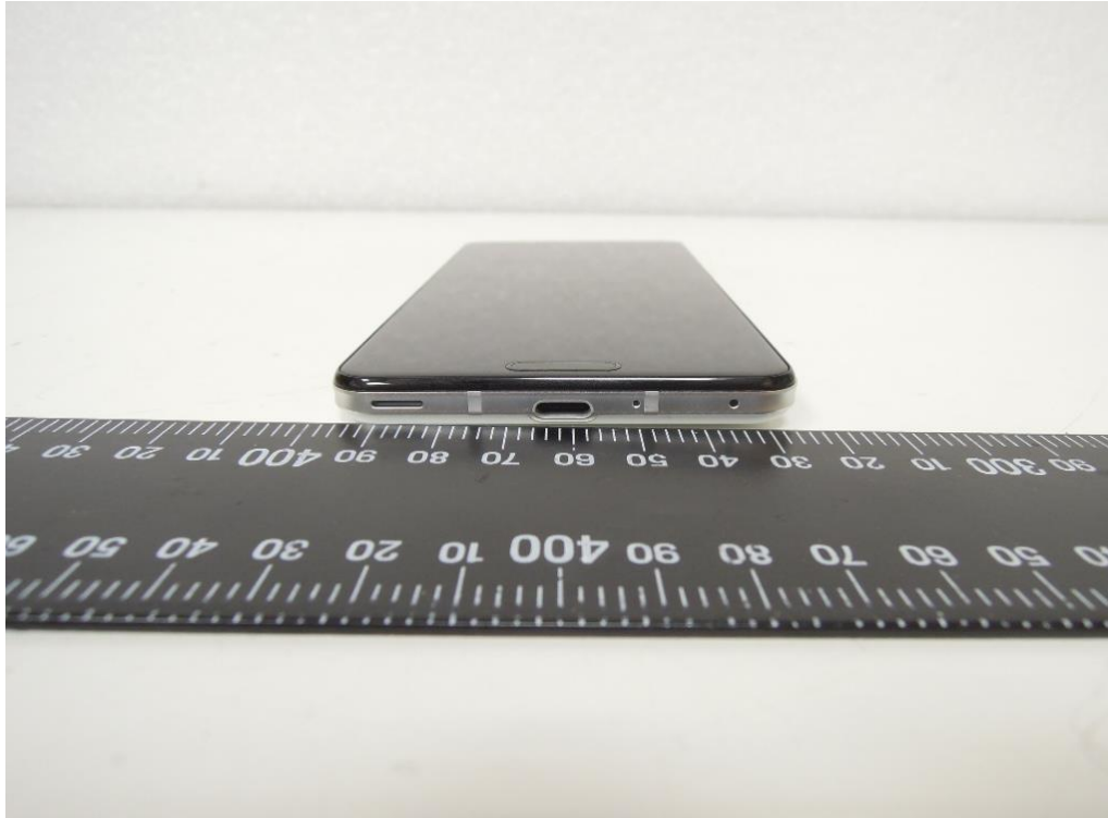
Side View of EUT – 4