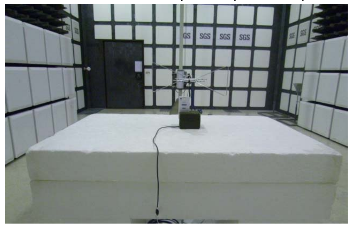
Radiated Emission Set up Photos (Above 1GHz)