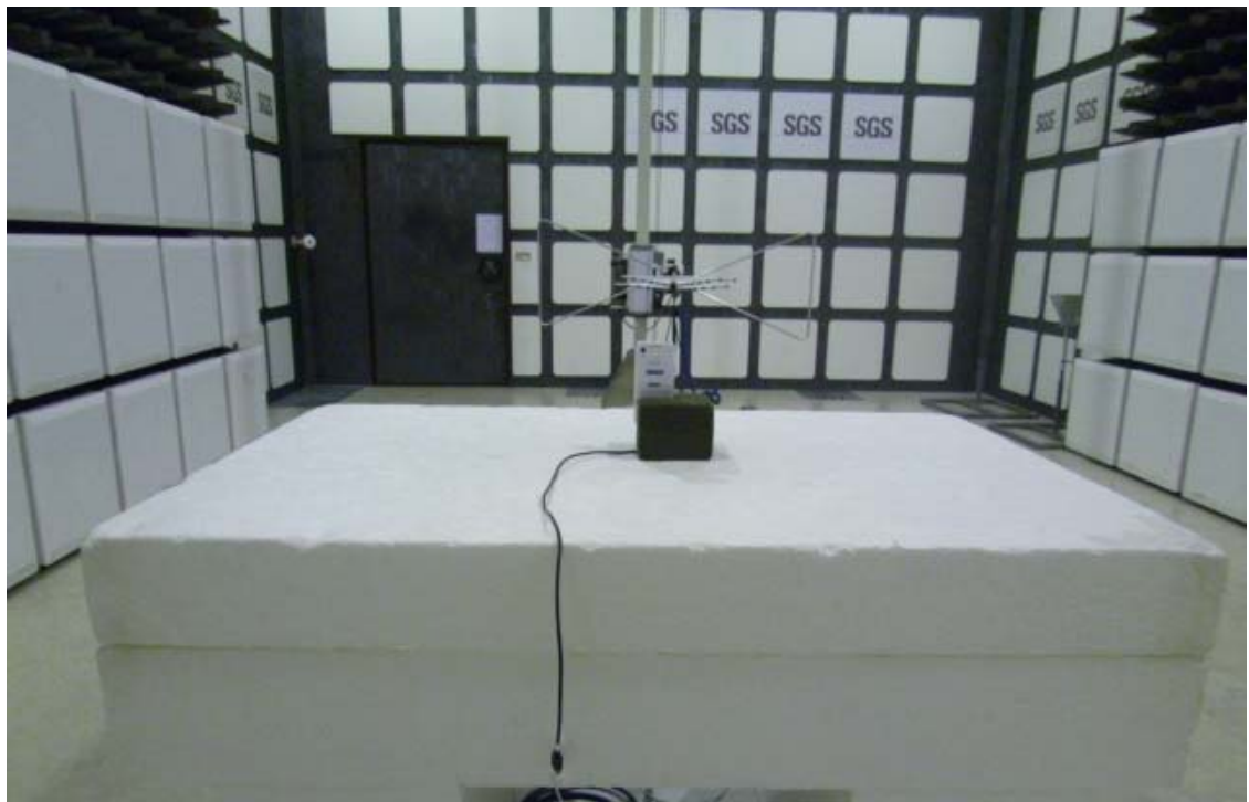
Radiated Emission Set up Photos (Above 1GHz)