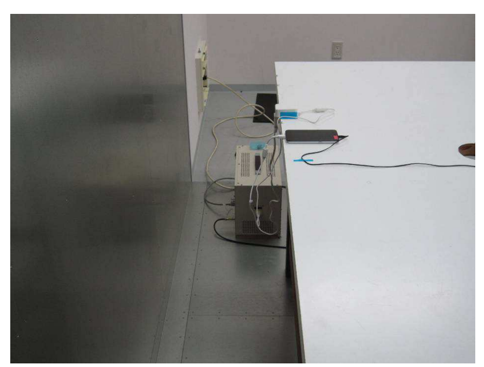
- Side View -