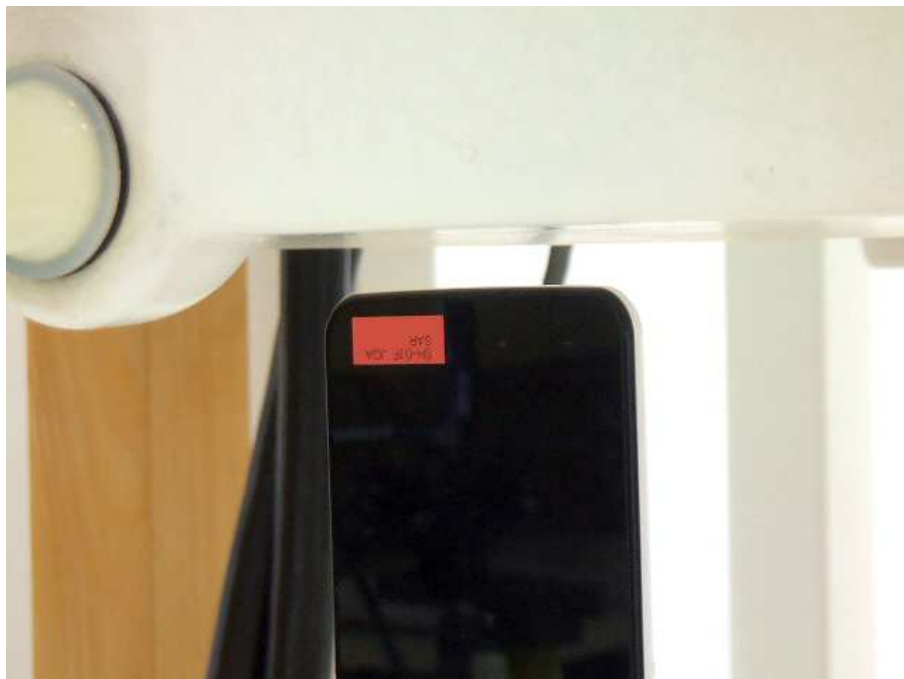
– Bottom Edge –