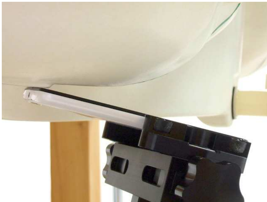
– Ear-Tilt Position –