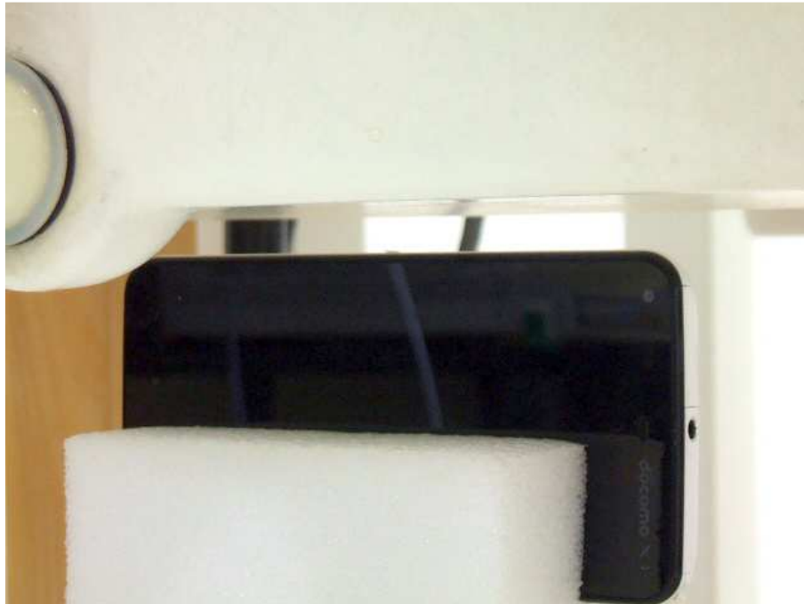
- Left Edge -