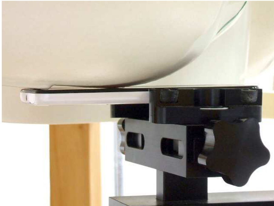
– Cheek-Touch Position –