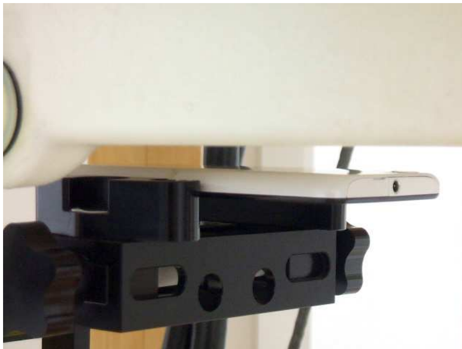
– Rear Side –