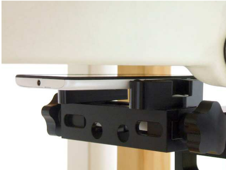
– Front Side –