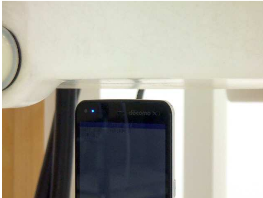
– Top Edge –