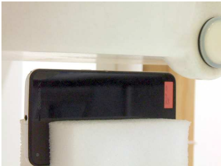
- Right Edge -