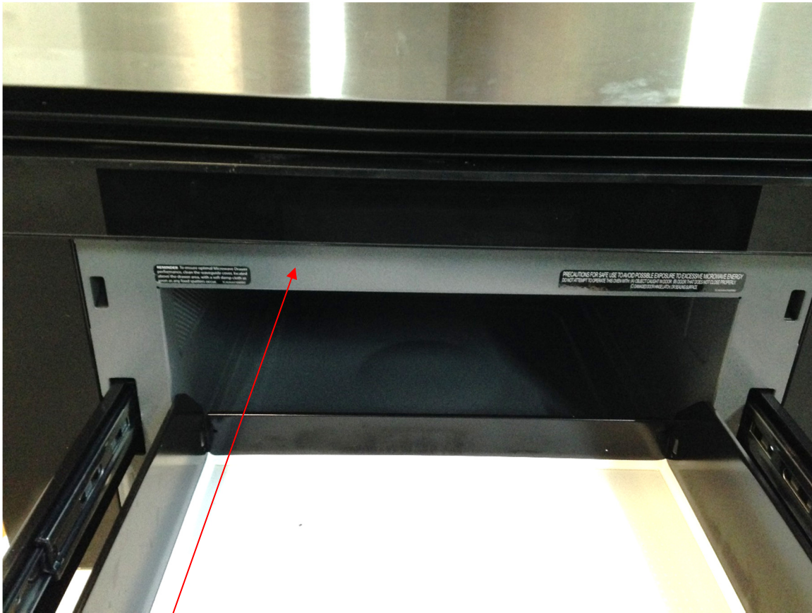
Figure 2. Label Location

FCC Part 18 Subpart C APYDMR0182 23-0051 May 24, 2023 Sharp Corporation SWB3085HS