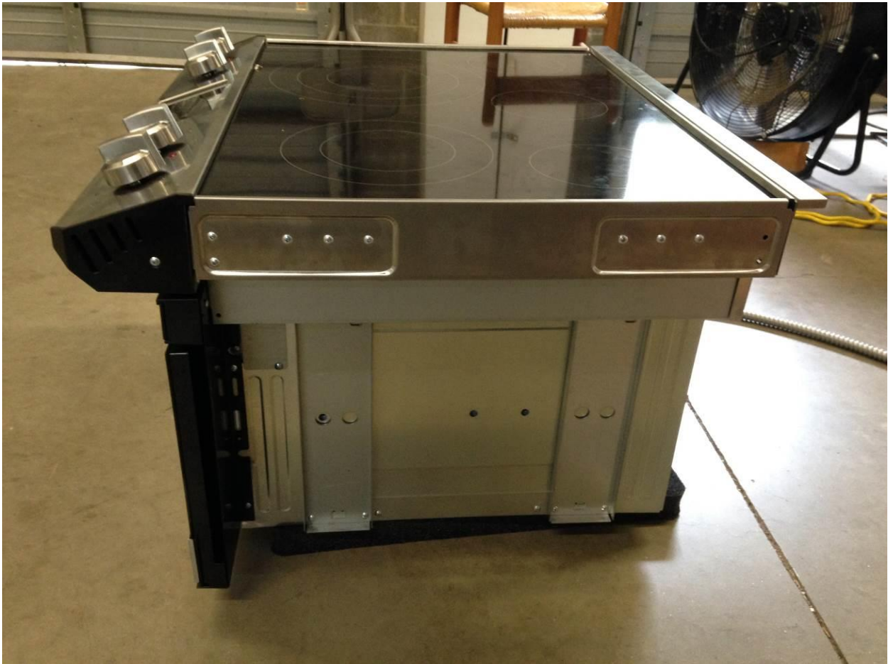
Figure 2. Side 1

FCC Part 18 Subpart C Certification 22-0219 August 23, 2022 Sharp Corporation APYDMR0181 STR3065HS