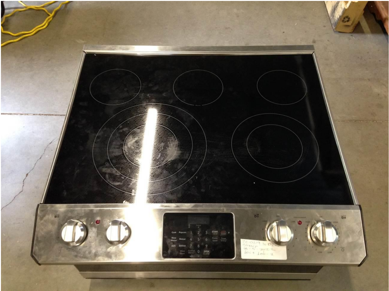
Figure 6. Top

FCC Part 18 Subpart C Certification 22-0219 August 23, 2022 Sharp Corporation APYDMR0181 STR3065HS