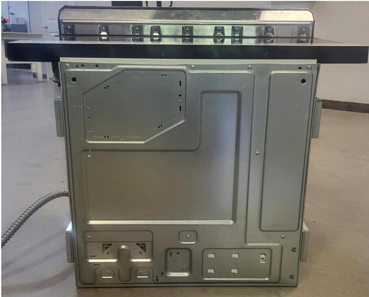
Figure 7. Bottom

FCC Part 18 Subpart C Certification 22-0219 August 23, 2022 Sharp Corporation APYDMR0181 STR3065HS