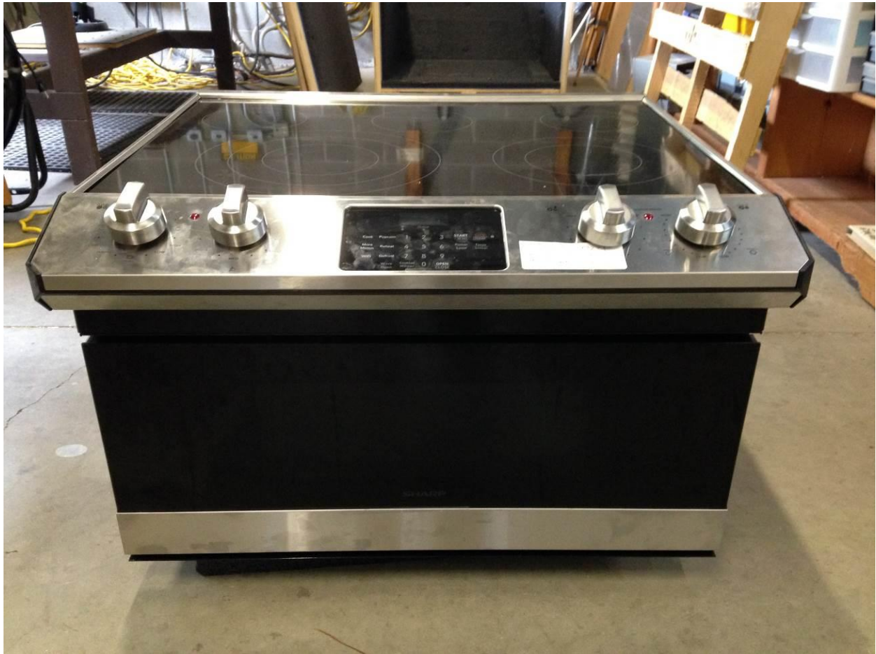
Figure 1. Front