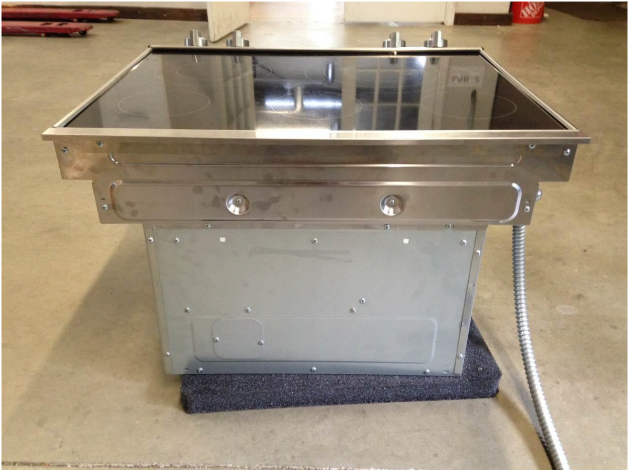
Figure 4. Rear

FCC Part 18 Subpart C Certification 22-0219 August 23, 2022 Sharp Corporation APYDMR0181 STR3065HS