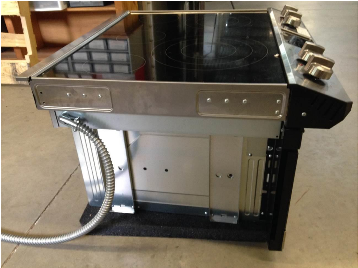
Figure 3. Side 2

FCC Part 18 Subpart C Certification 22-0219 August 23, 2022 Sharp Corporation APYDMR0181 STR3065HS