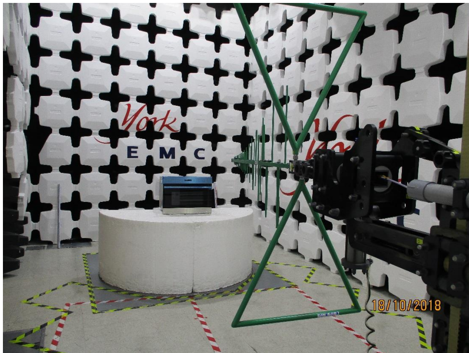
Radiated Electric Field Emissions 30MHz to 1GHz