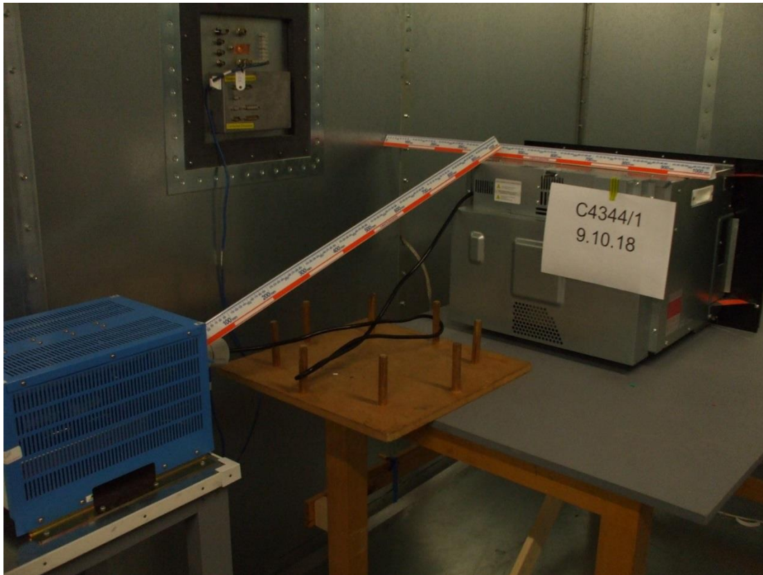
Mains conducted emissions