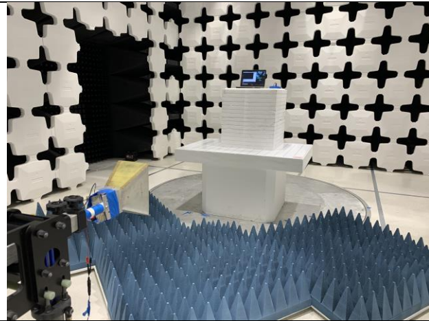
RE Above 1GHz – Front View