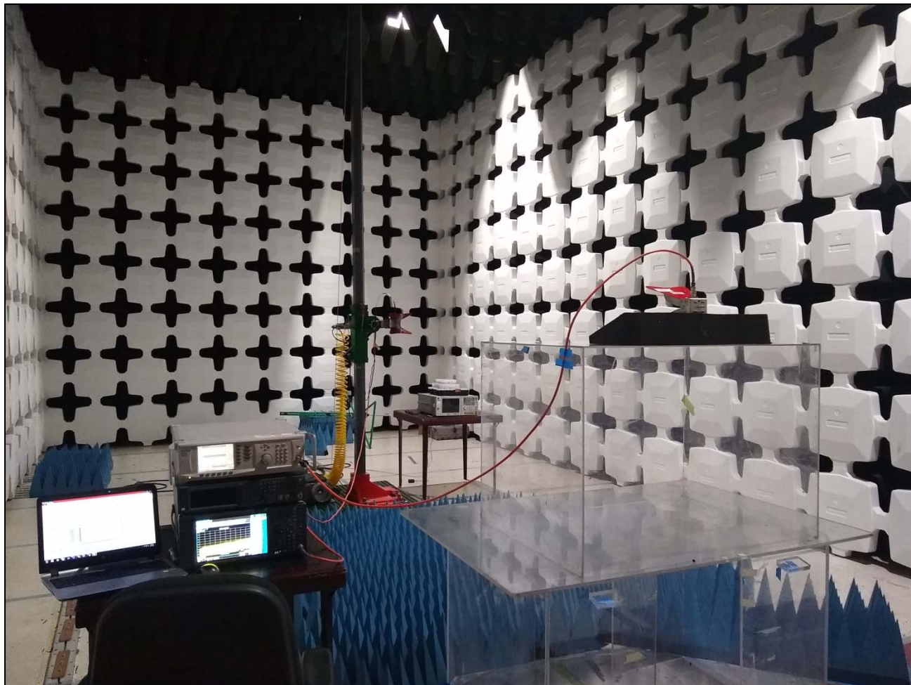
RSE Substitution Method Setup