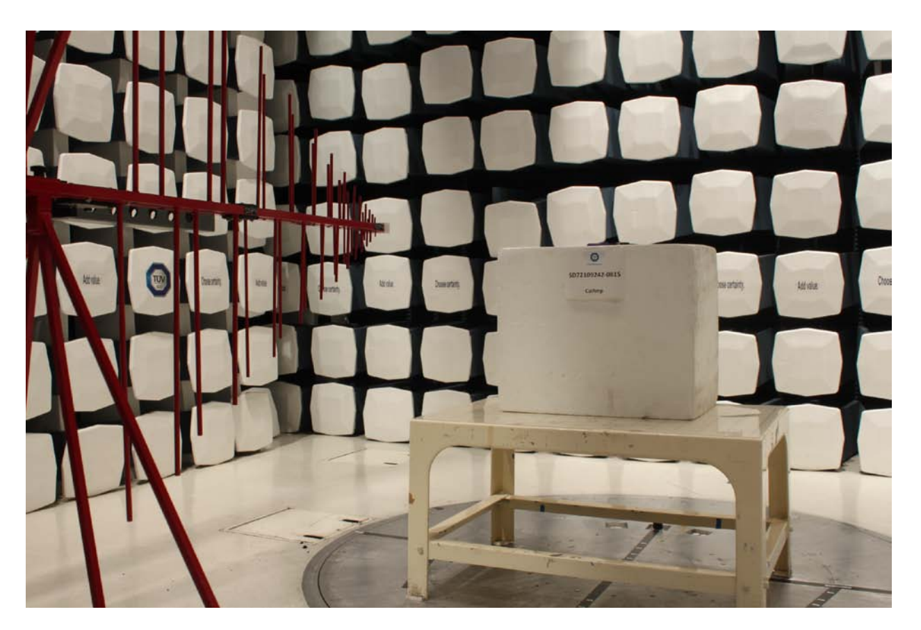
Radiated Emissions Test Setup (below 1GHz)