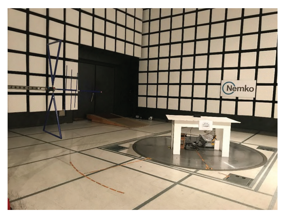
Figure 8.1.10 Radiated emissions setup from 30-1000 MHz