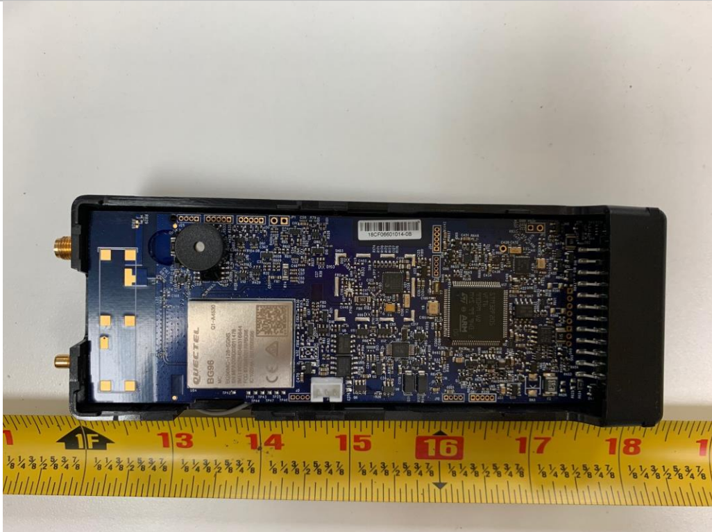
EUT Cover Off View-Top