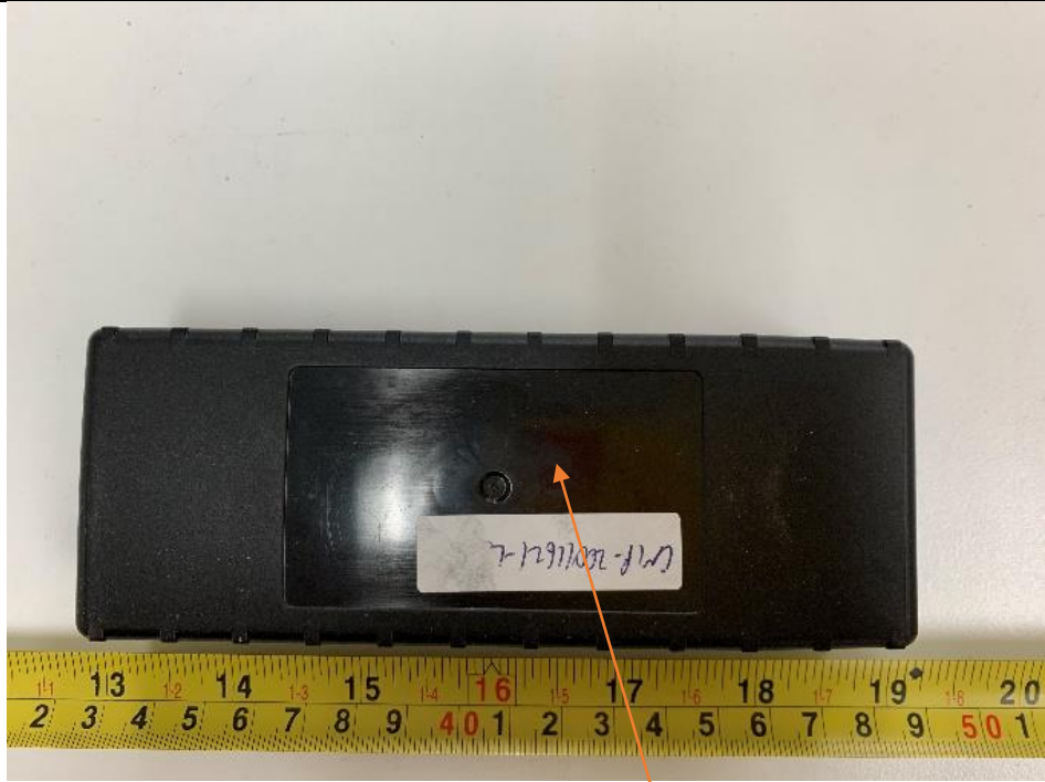
EUT Top View