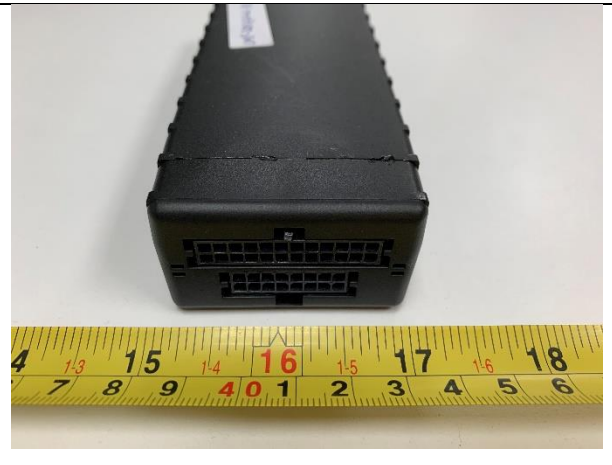
EUT Right View