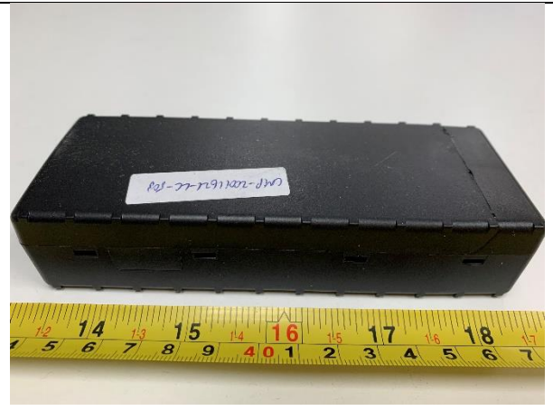
EUT Rear View