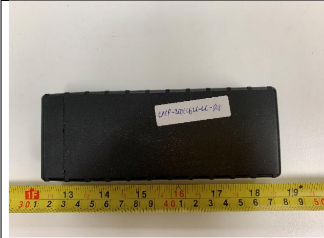
EUT Top View