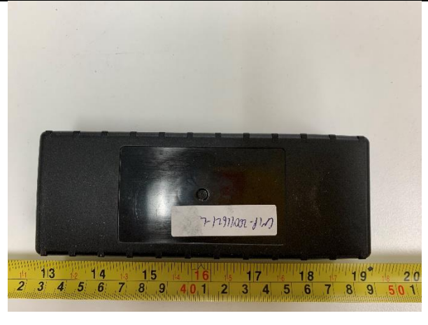
EUT Bottom View