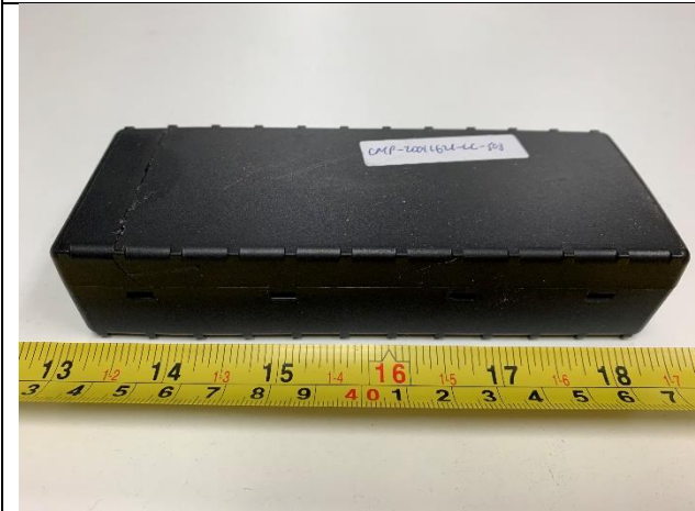
EUT Front View