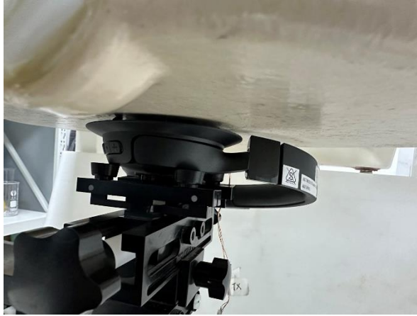
side 1 0mm