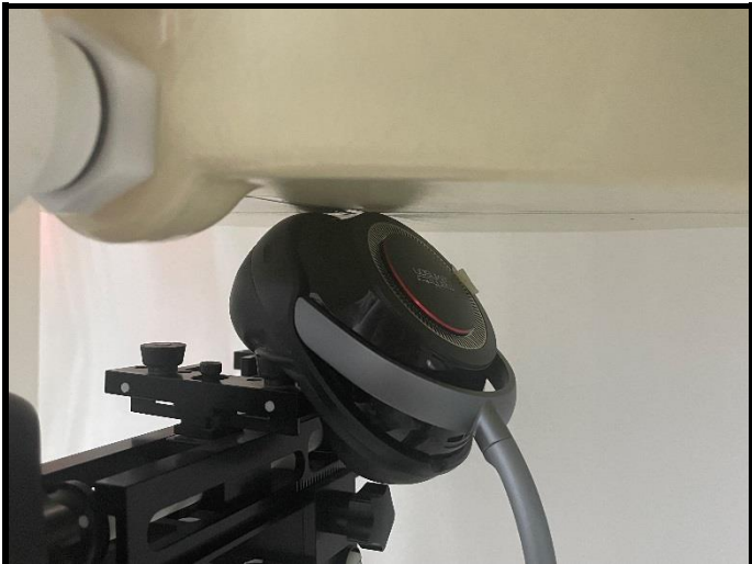
Curved surface of Bottom Side (EUT with 0 cm Gap)