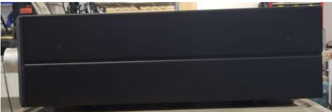
Figure 8: Photo of EUT, model No5802 (Right)