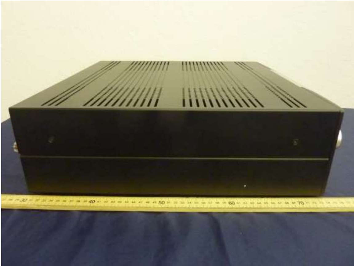
Figure 3: Photo of EUT, model No5805 (Left)