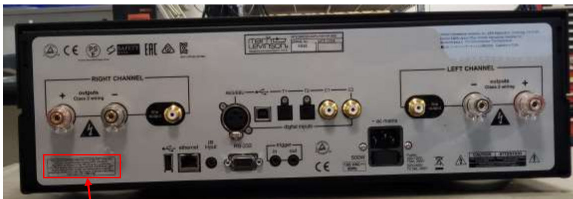
Figure 10: Photo of EUT, model No5802 (Rear)