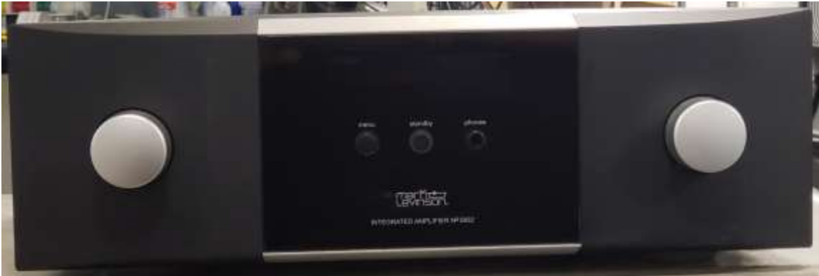
Figure 6: Photo of EUT, model No5802 (Front)