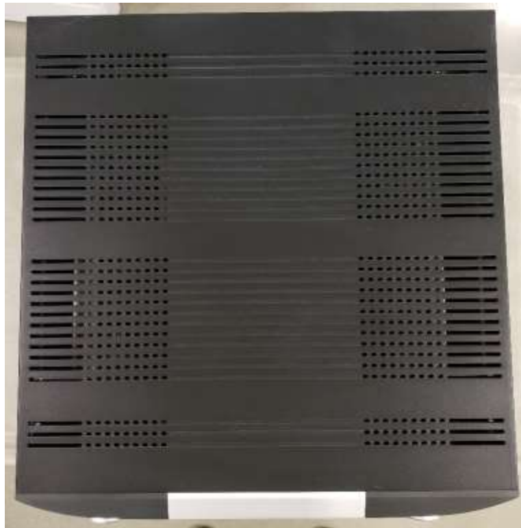
Figure 9: Photo of EUT, model No5802 (Top)