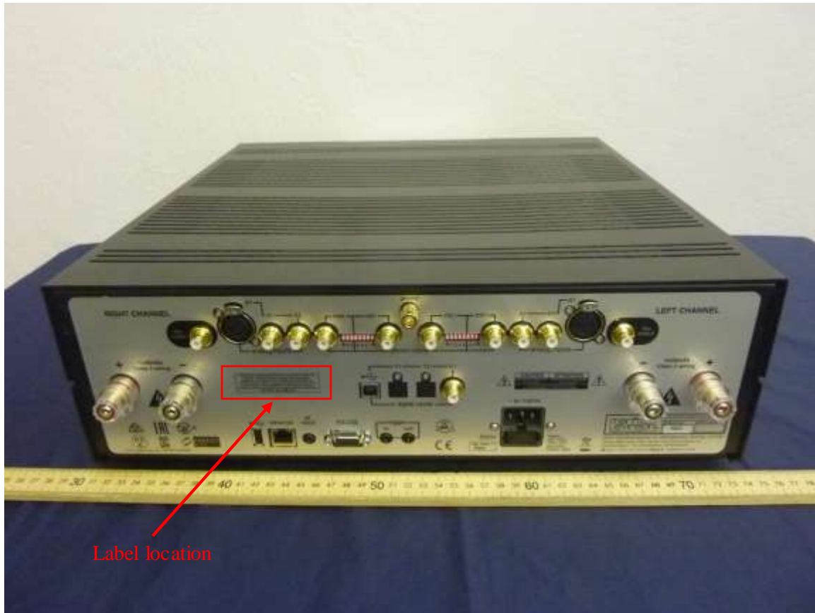
Figure 5: Photo of EUT, model No5805 (Rear)