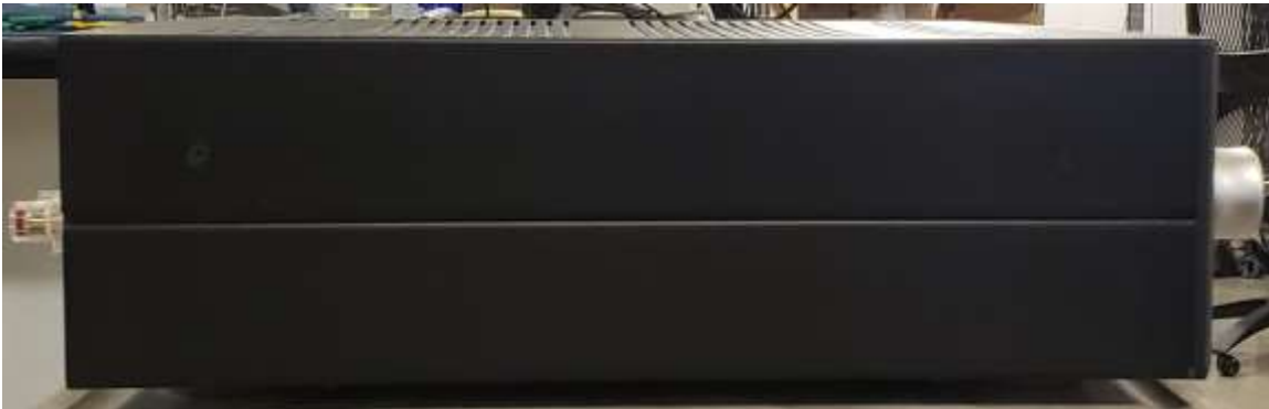
Figure 7: Photo of EUT, model No5802 (Left)