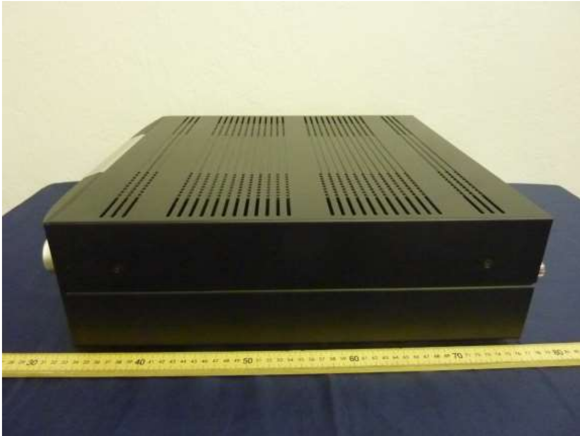
Figure 4: Photo of EUT, model No5805 (Right)