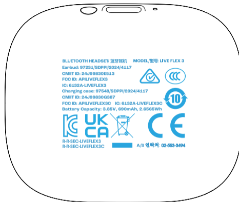
Compliance translucent glossy silk screen