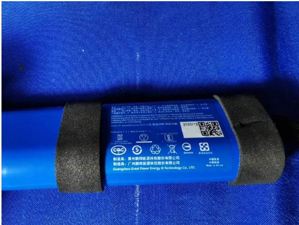
Battery: GSP-2S2P-XT3A, BQ28Z610