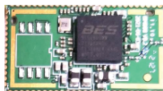
(This Photos are for reference only)