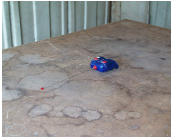
Radiated Open Site Test Set-up