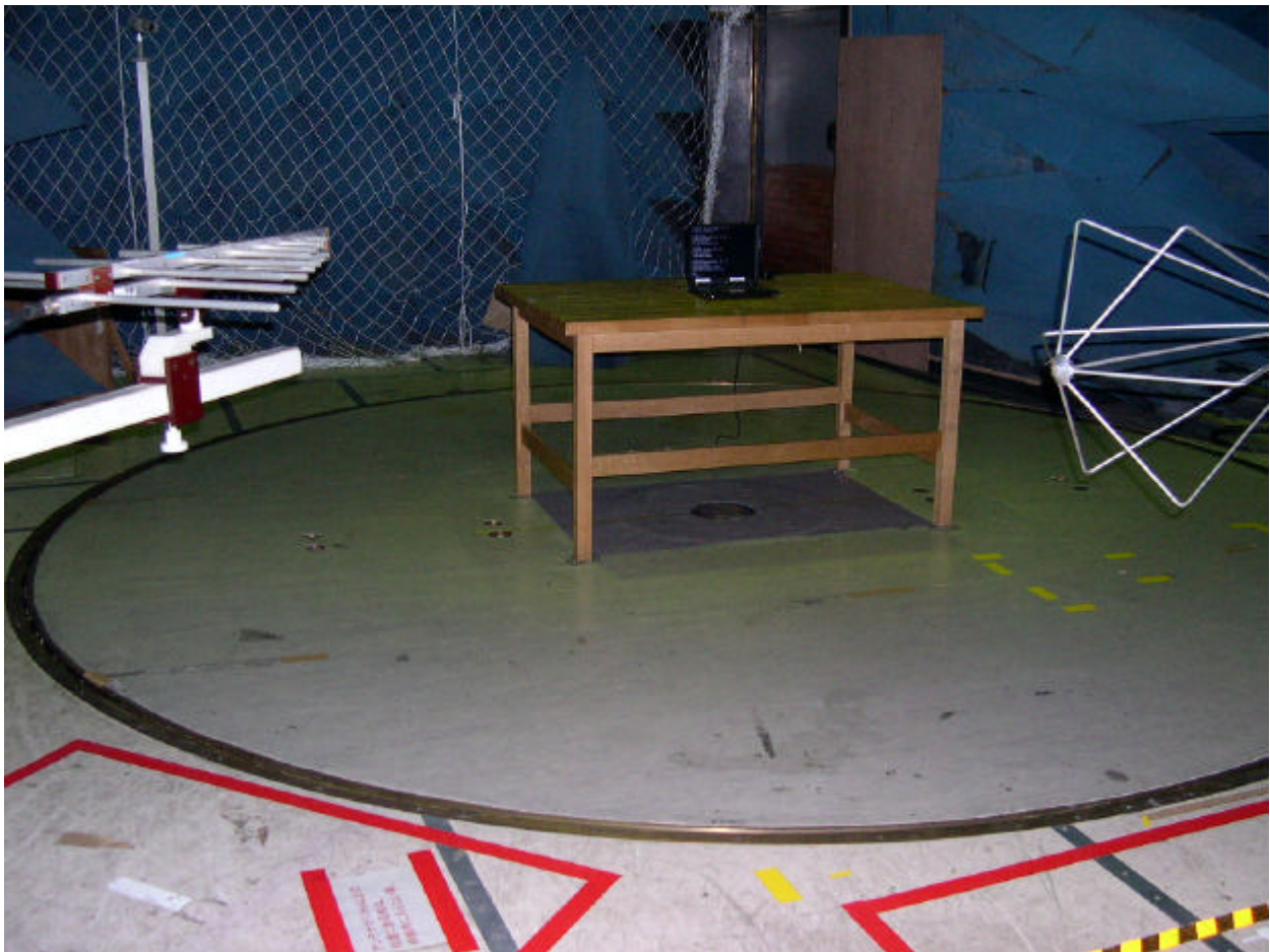
EMI-Radiation Front view