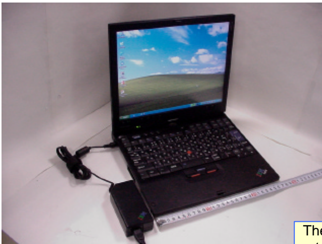
“Notebook” operation mode