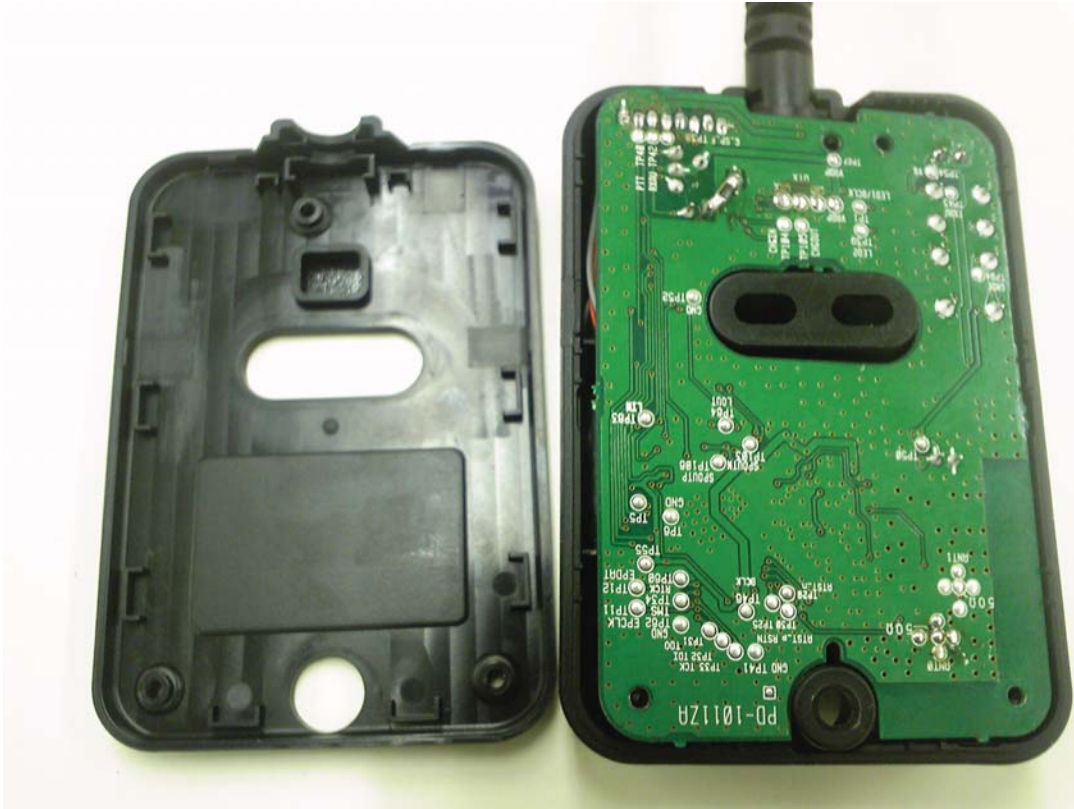
Rear Cover opened