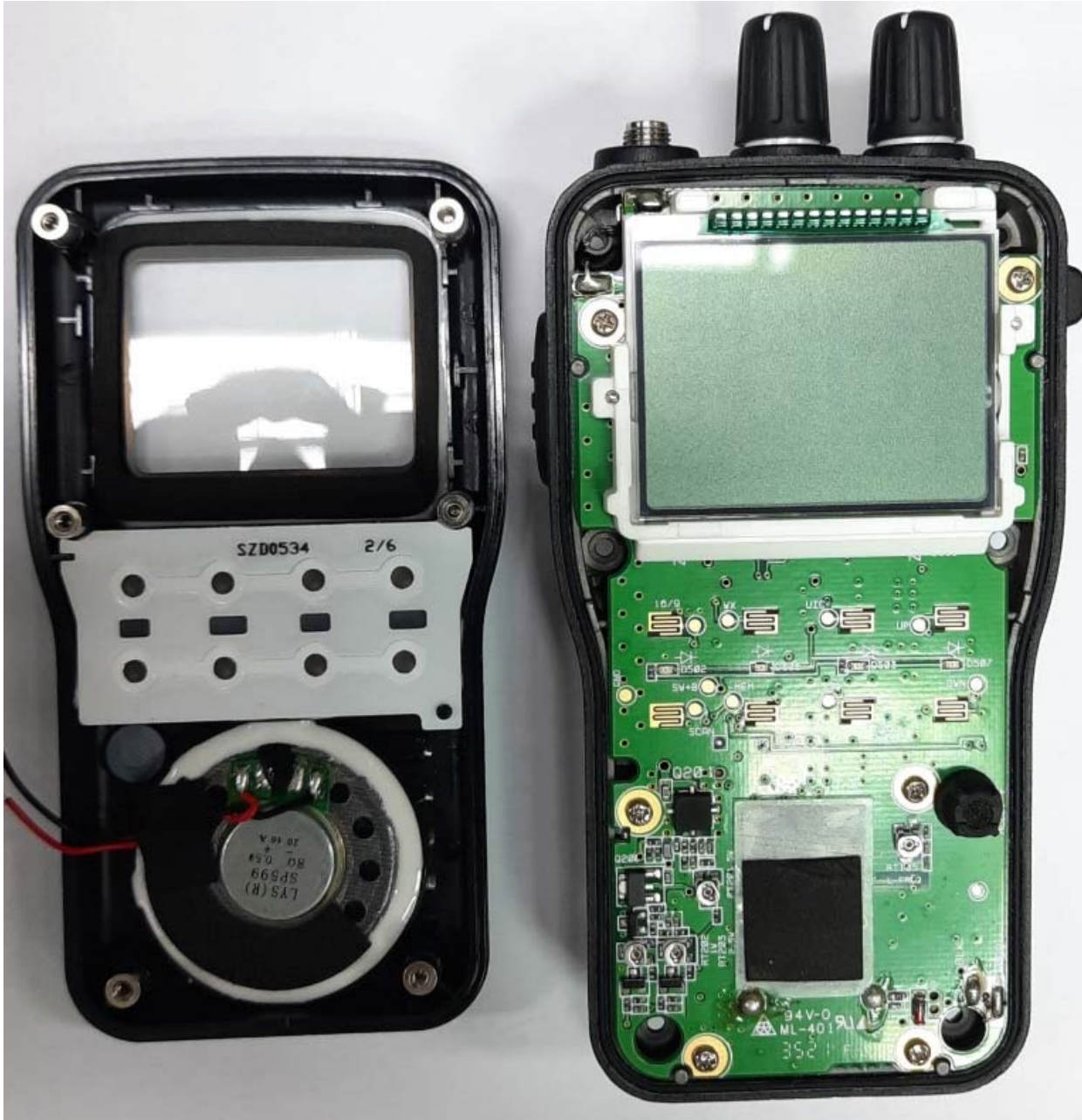
Figure E22.1 – Internal, Front Removed