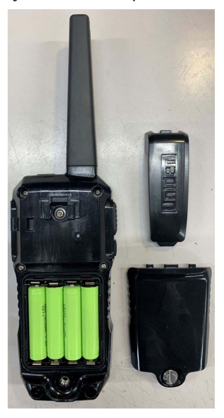
Figure E19.1 – Internal Photo – Battery Cover Removed