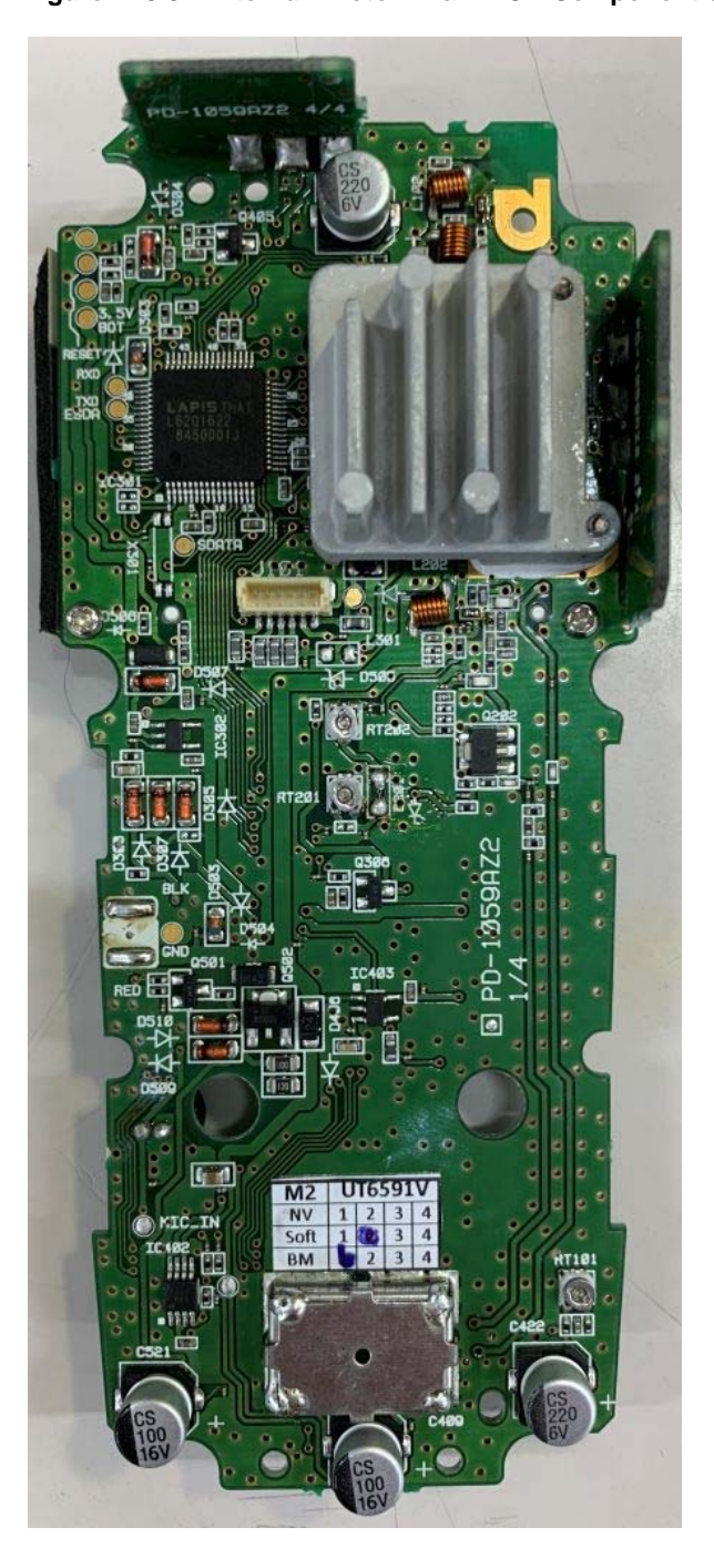
Figure E19.5 - Internal Photo - Main PCB Component Side