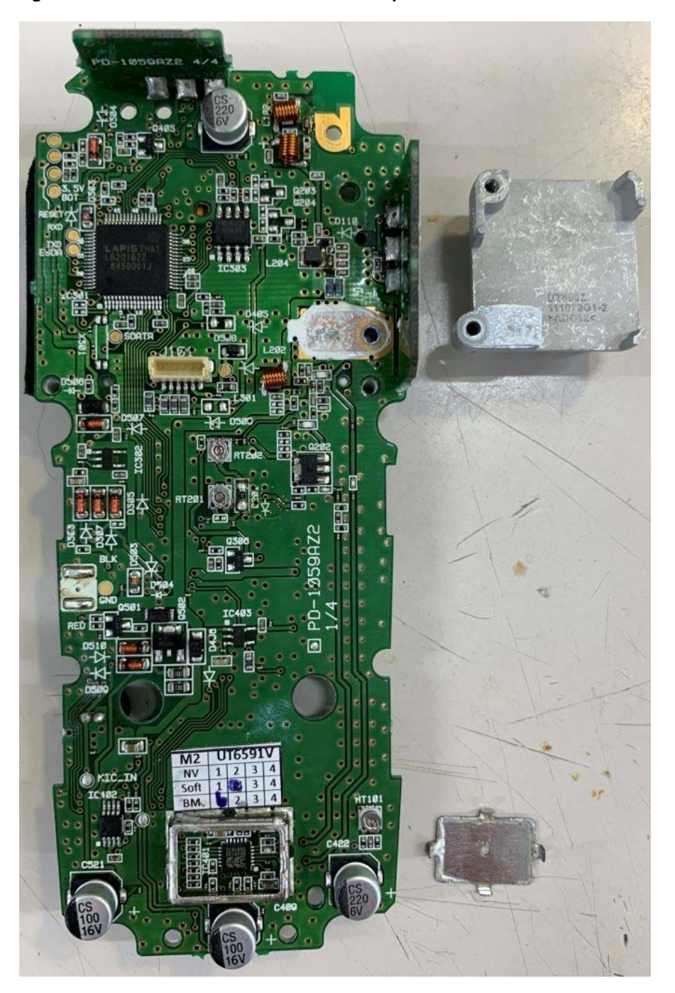
Figure E19.6 - Internal Photo - Main PCB Component Side - Heat Sinks Removed