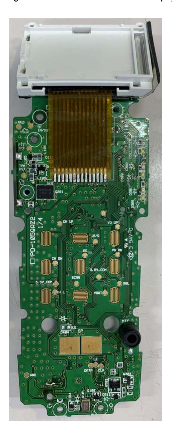
Figure E19.8 - Internal Photo - Main PCB Display Side - Display Removed