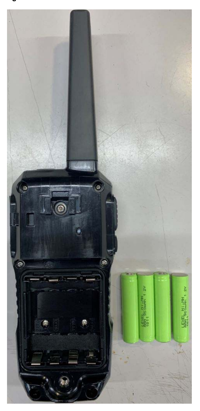
Figure E19.2 - Internal Photo - Batteries Removed