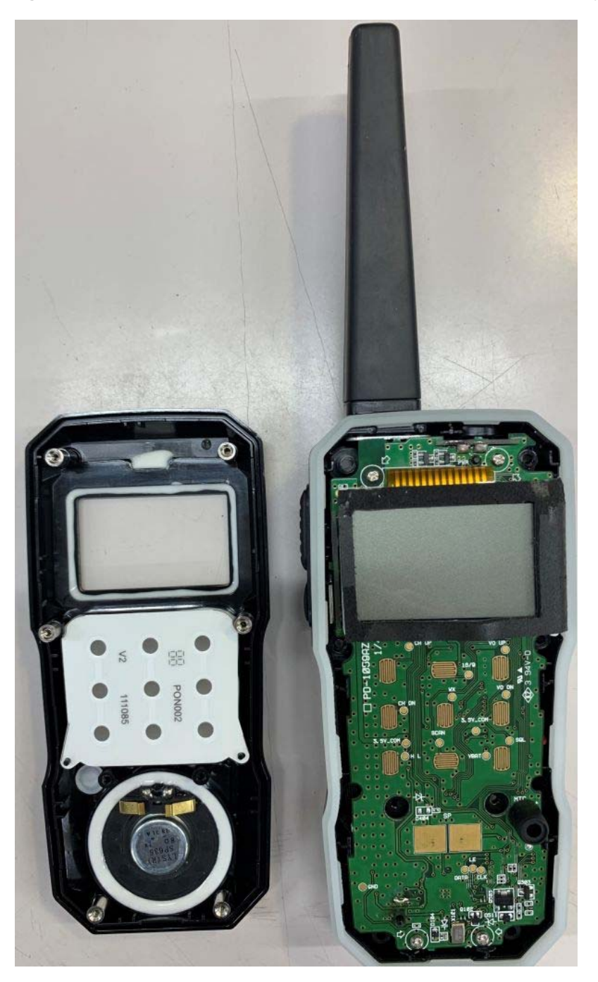
Figure E19.3 - Internal Photo - Front Cover Removed - Main PCB Display Side