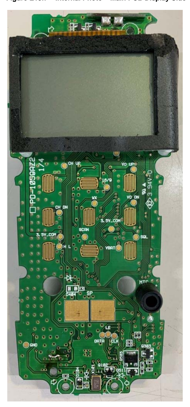
Figure E19.7 - Internal Photo - Main PCB Display Side