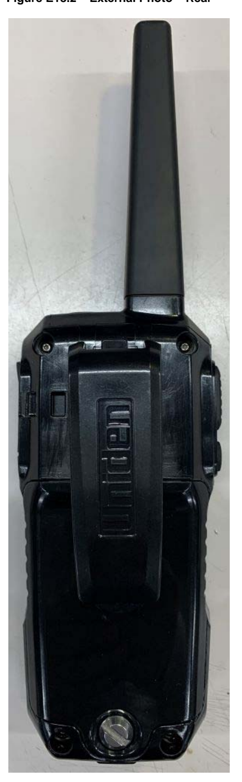
Figure E18.2 – External Photo – Rear