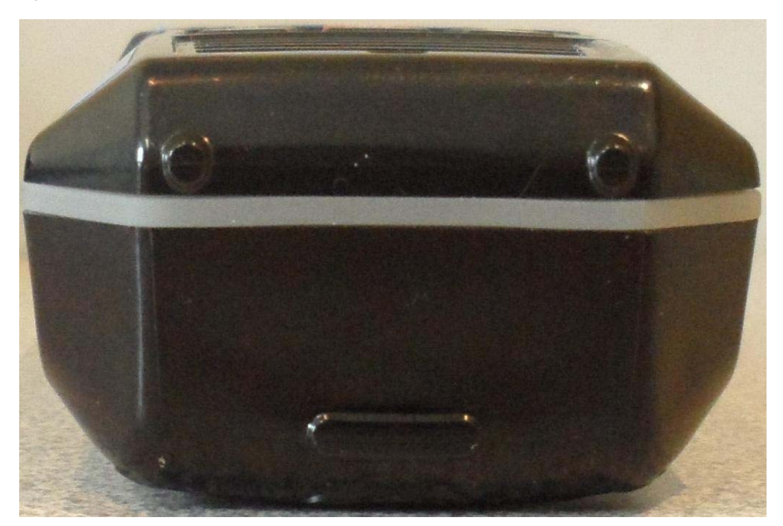
Figure E18.5 - External Photo - Bottom