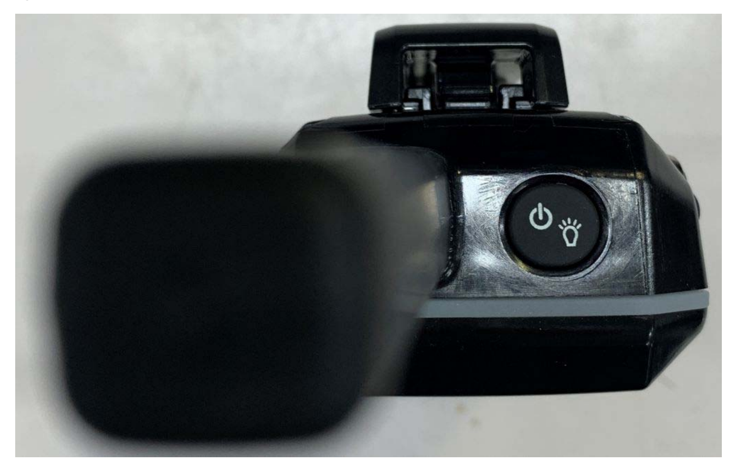
Figure E18.5 - External Photo - Top