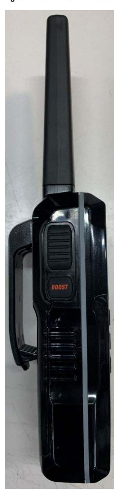
Figure E18.3 - External Photo - Left Side