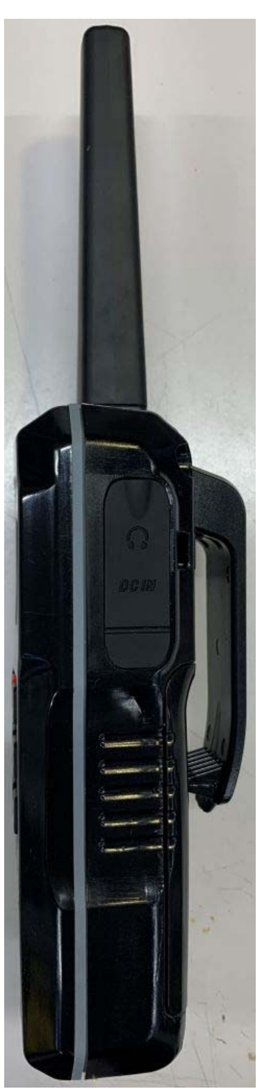
Figure E18.4 – External Photo – Right Side