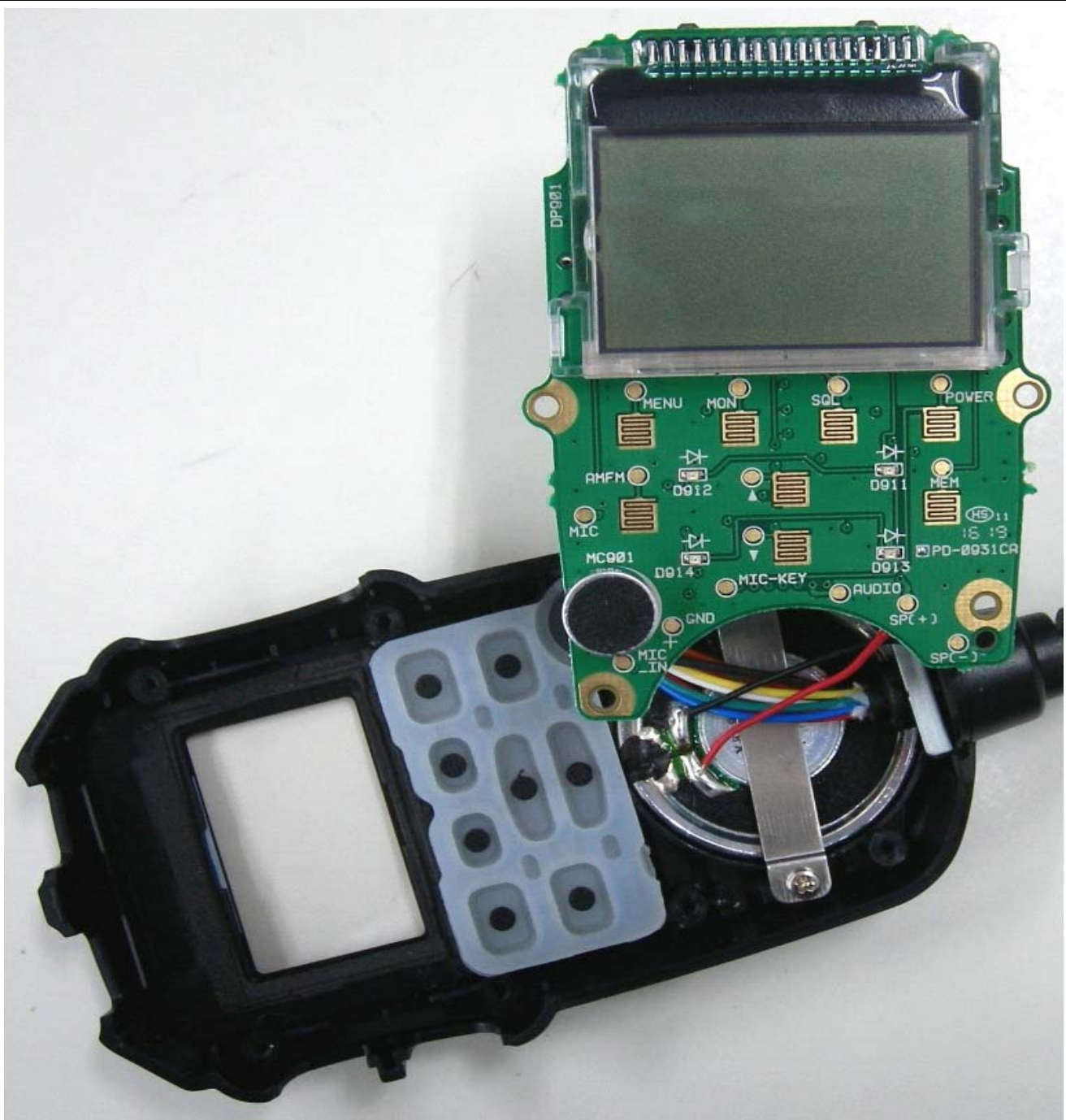
Remote MIC PCB Bottom View