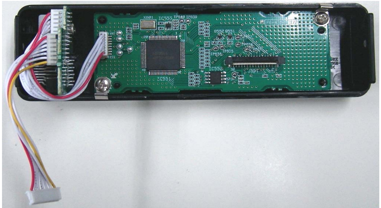
Front PCB Bottom View