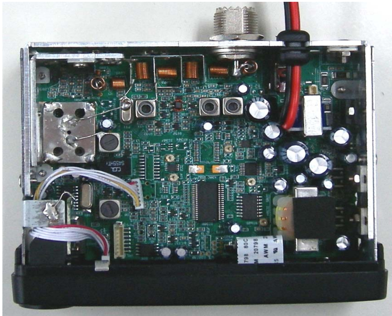
Main PCB Top View