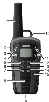
Radio color/pattern varies according to model number.

*Range may vary depending on environmental and/or topographical conditions.