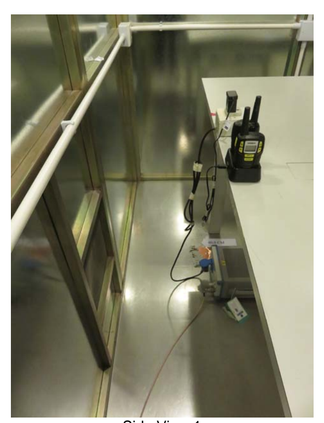
Side View 1

Test Report Number: 16121141HKG-001 FCC ID: AMWSX237