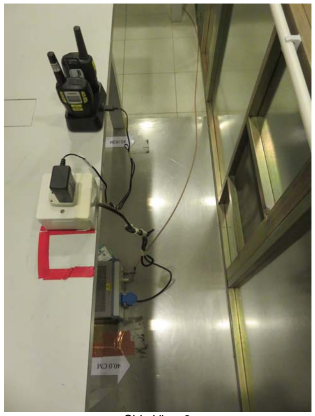
Side View 2

Test Report Number: 16121141HKG-001 FCC ID: AMWSX237