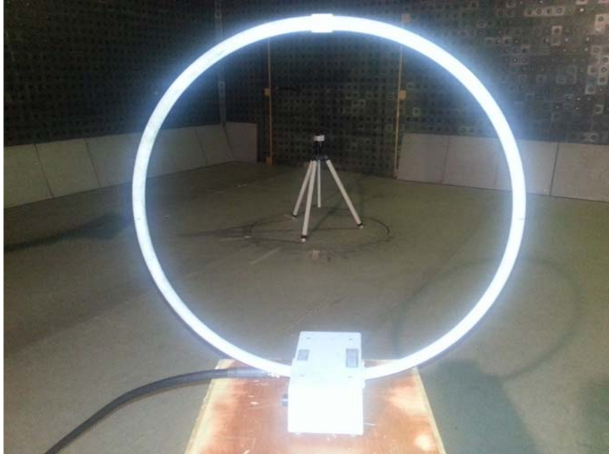
Photograph No.1 Setup for spurious emission field strength measurements in the anechoic chamber below 30 MHz