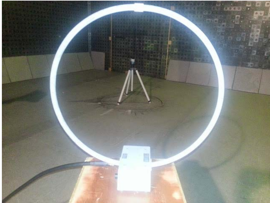
Photograph No.1 Setup for spurious emission field strength measurements in the anechoic chamber below 30 MHz