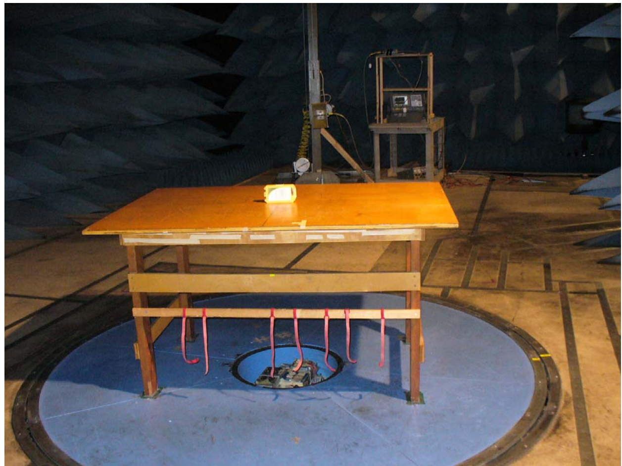
Figure 6: Radiated Emissions – Back View (EUT Side)