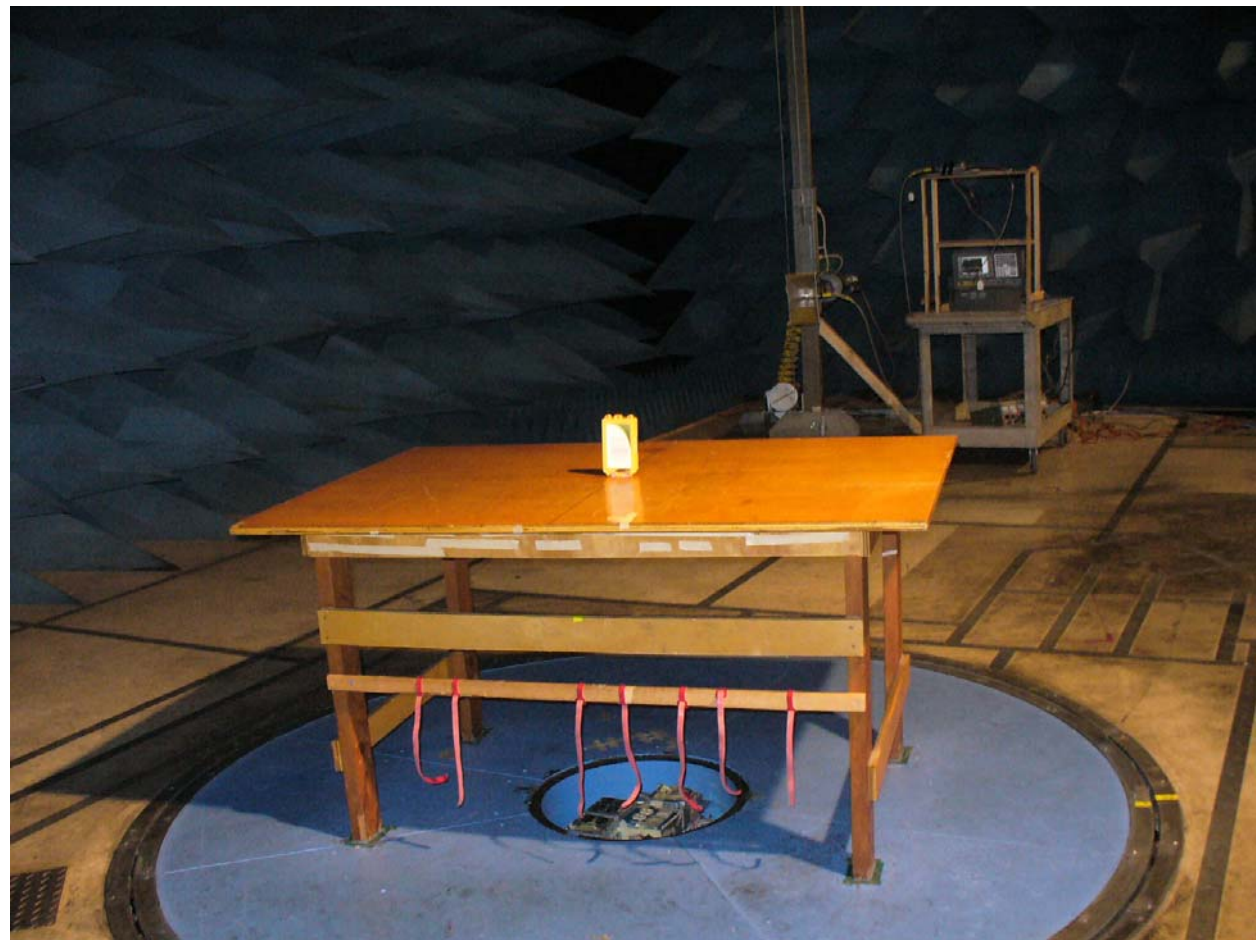
Figure 4: Radiated Emissions – Back View (EUT Standing)