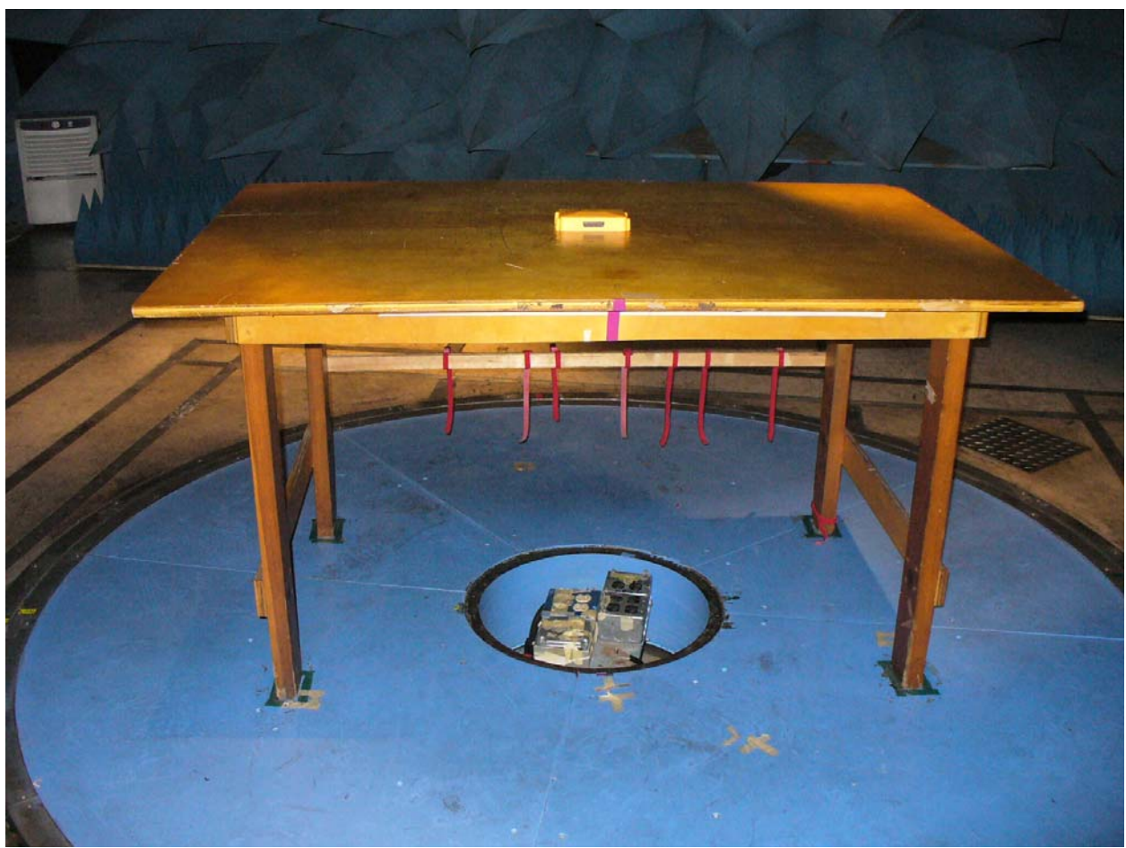
Figure 1: Radiated Emissions – Front View (EUT Flat)