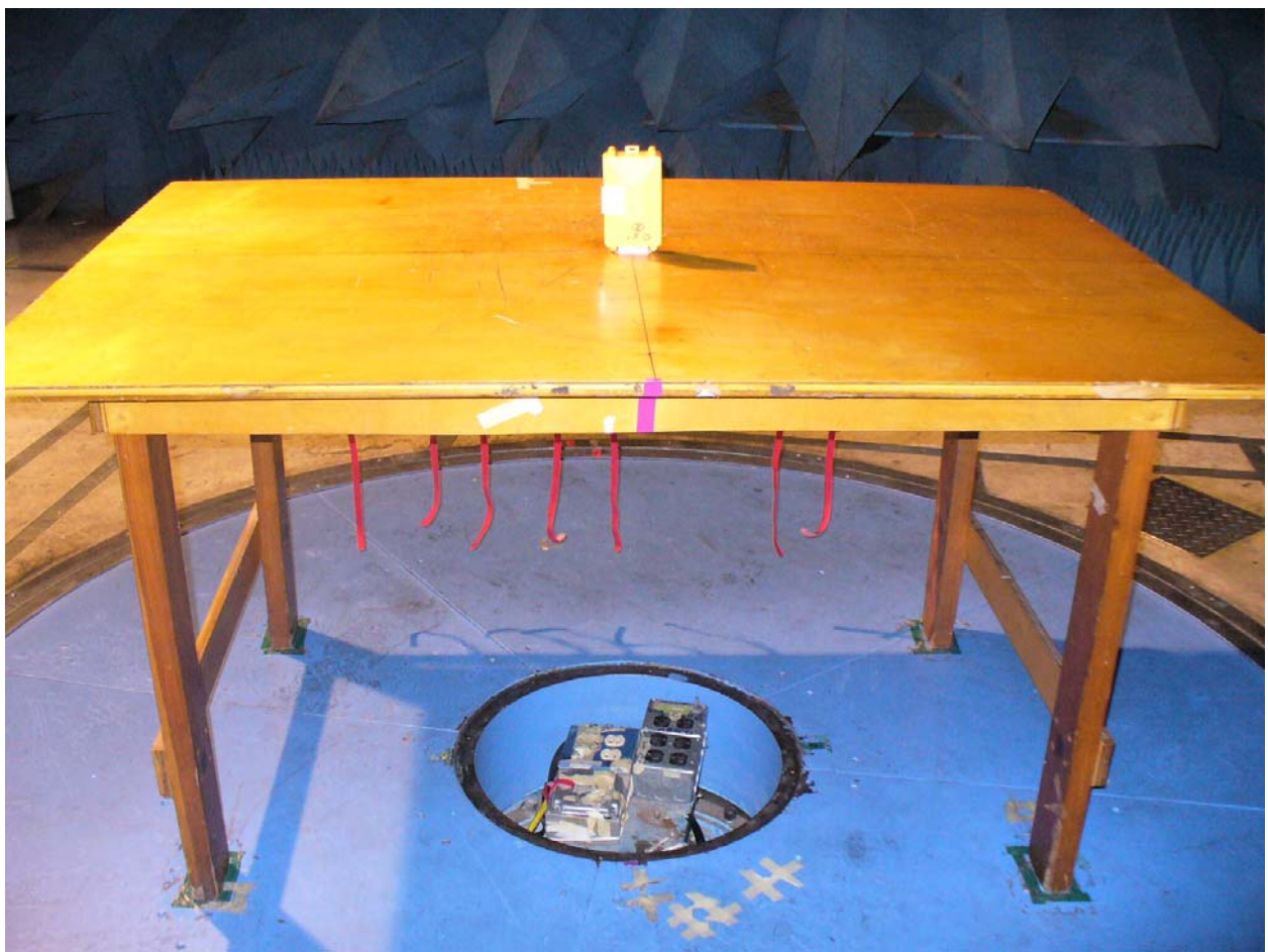
Figure 3: Radiated Emissions – Front View (EUT Standing)