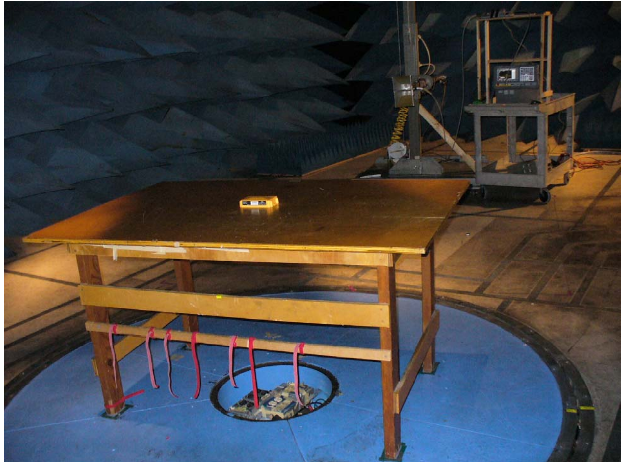
Figure 2: Radiated Emissions – Back View (EUT Flat)