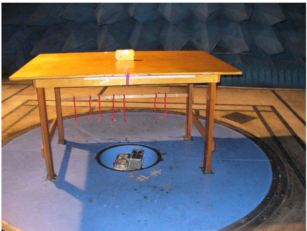
Figure 5: Radiated Emissions – Front View (EUT Side)