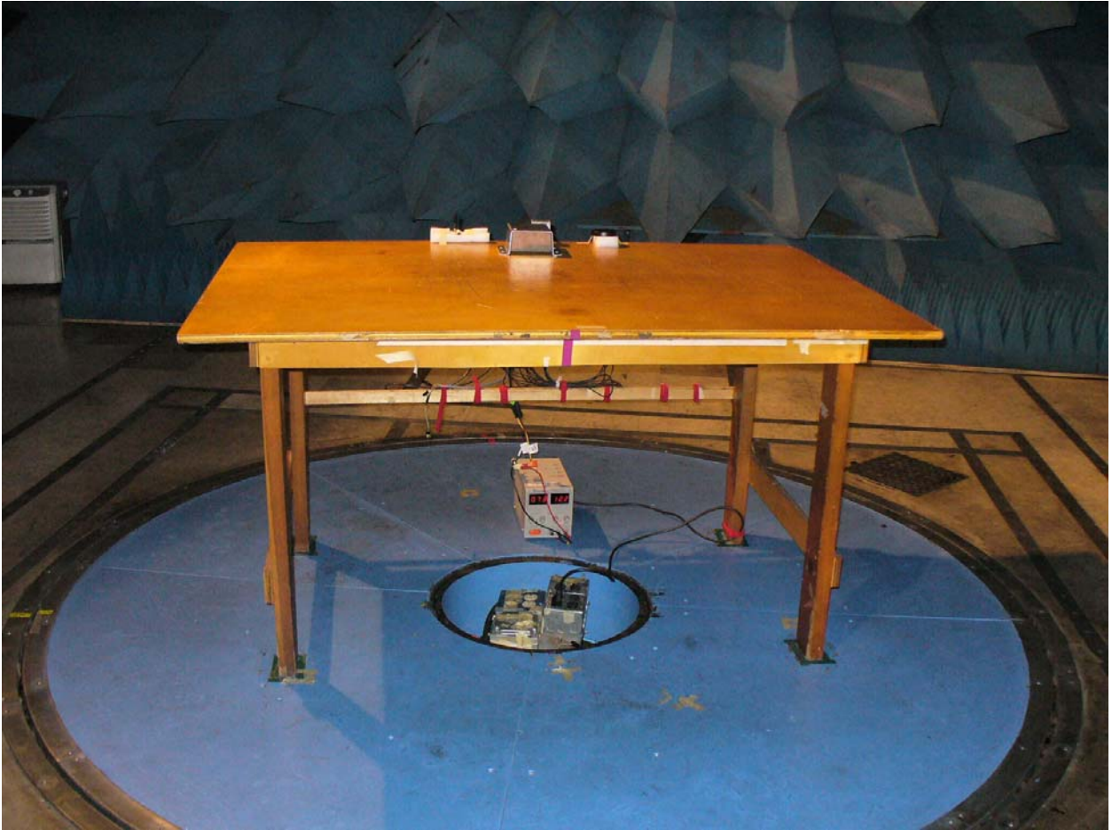
Figure 1: Radiated Emissions – Front View