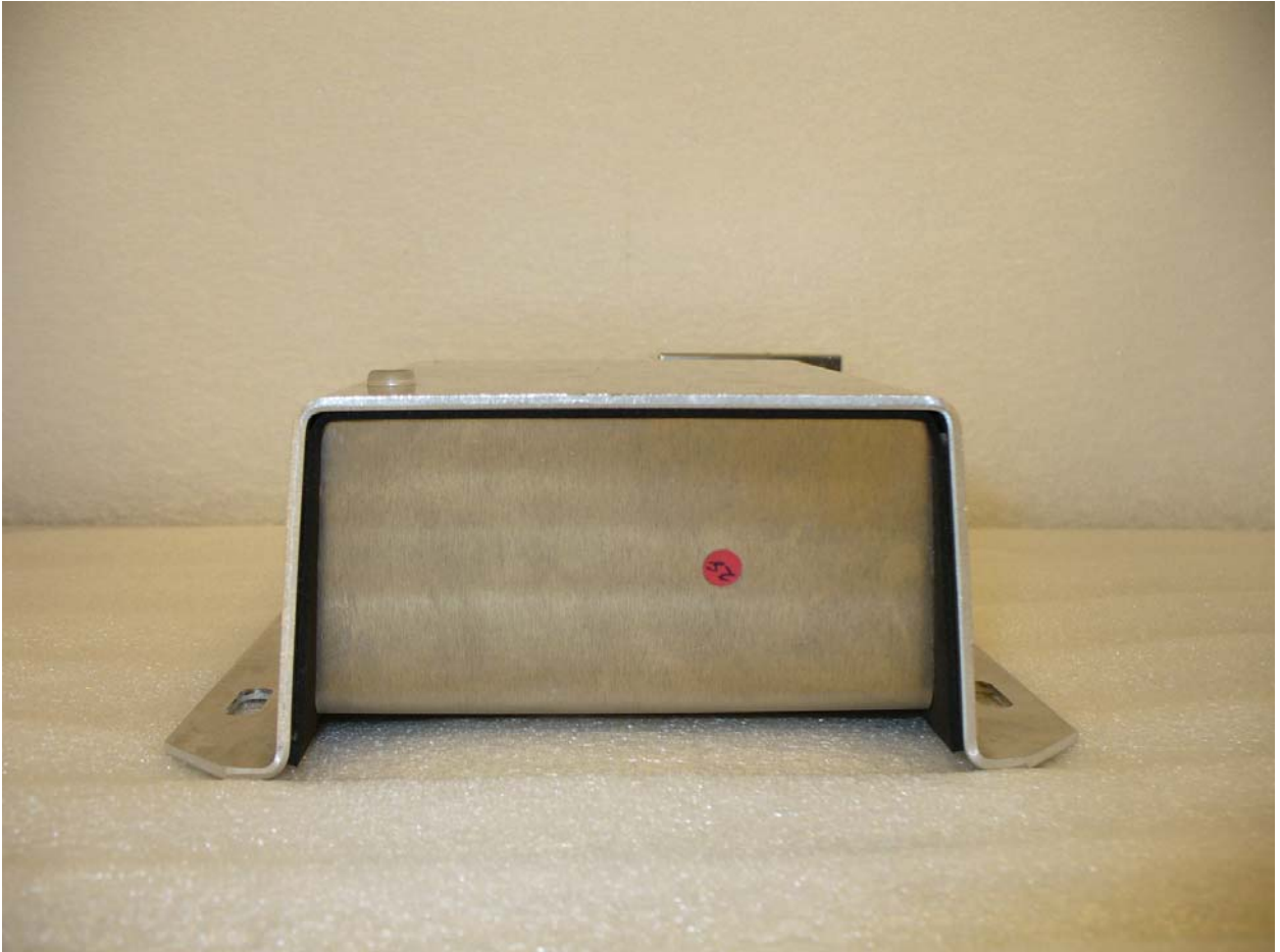
Figure 10: Rear View (with Splitter)