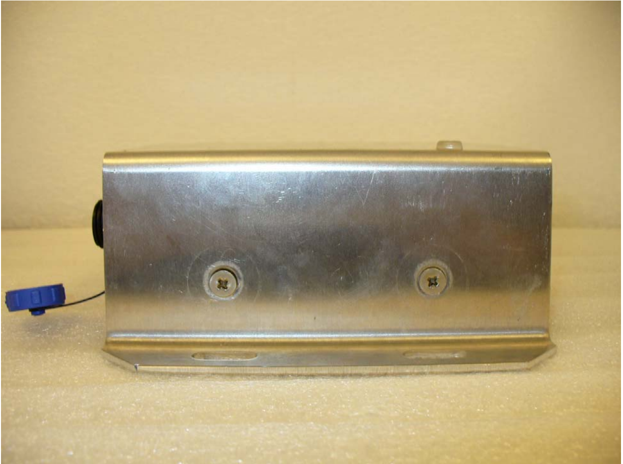
Figure 5: Right Side View