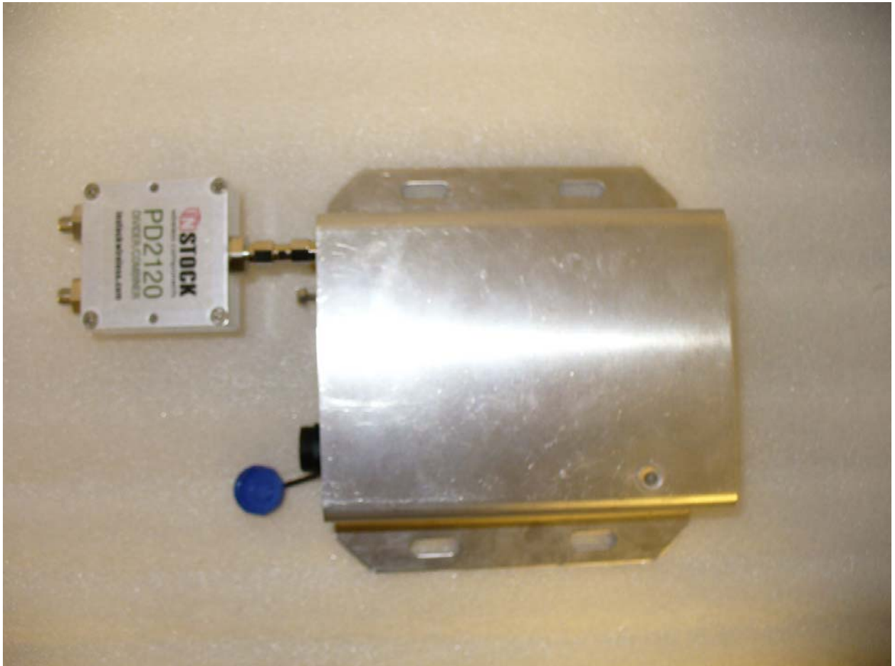
Figure 7: Top View (with Splitter)