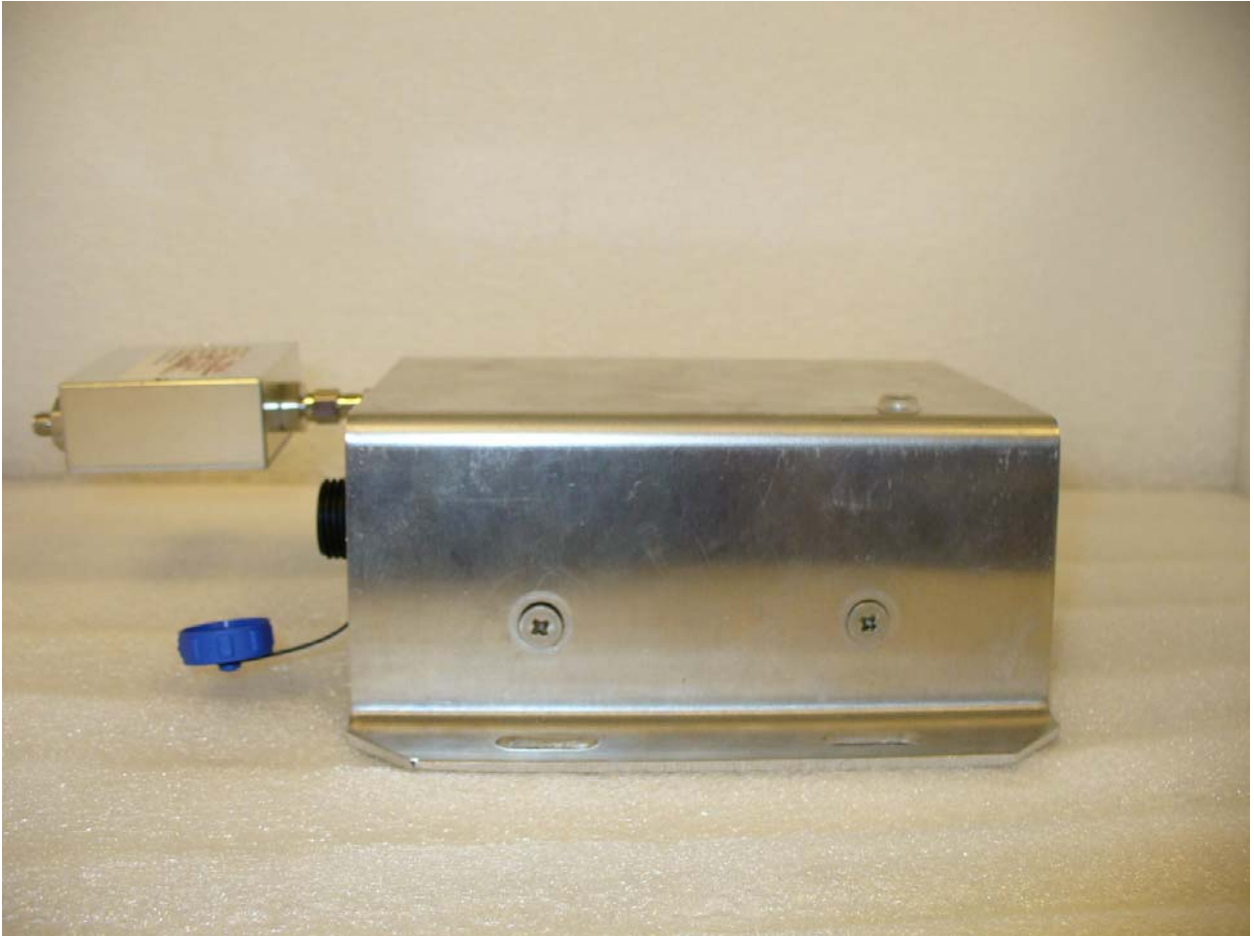
Figure 11: Right Side View (with Splitter)