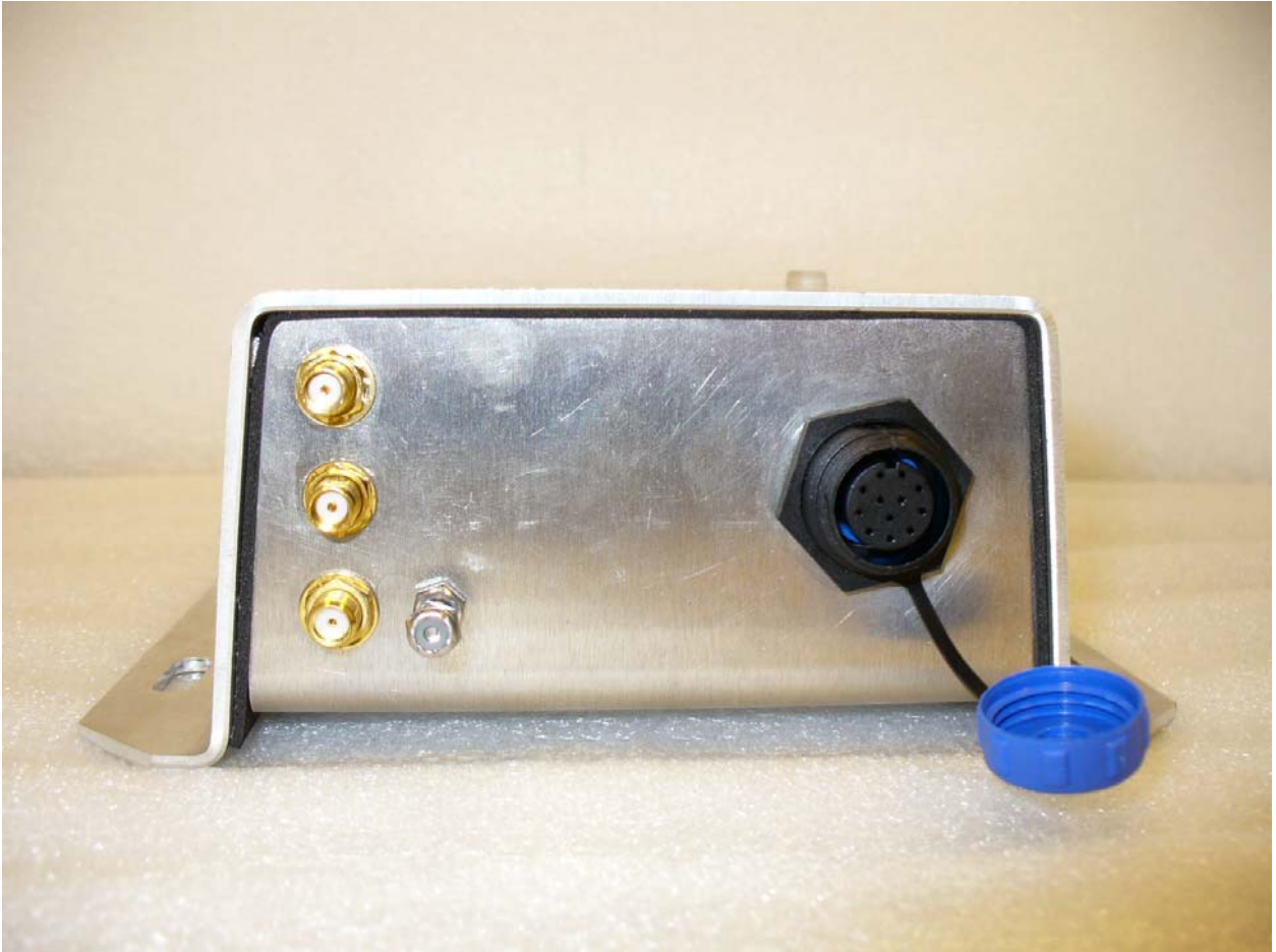
Figure 3: Front View