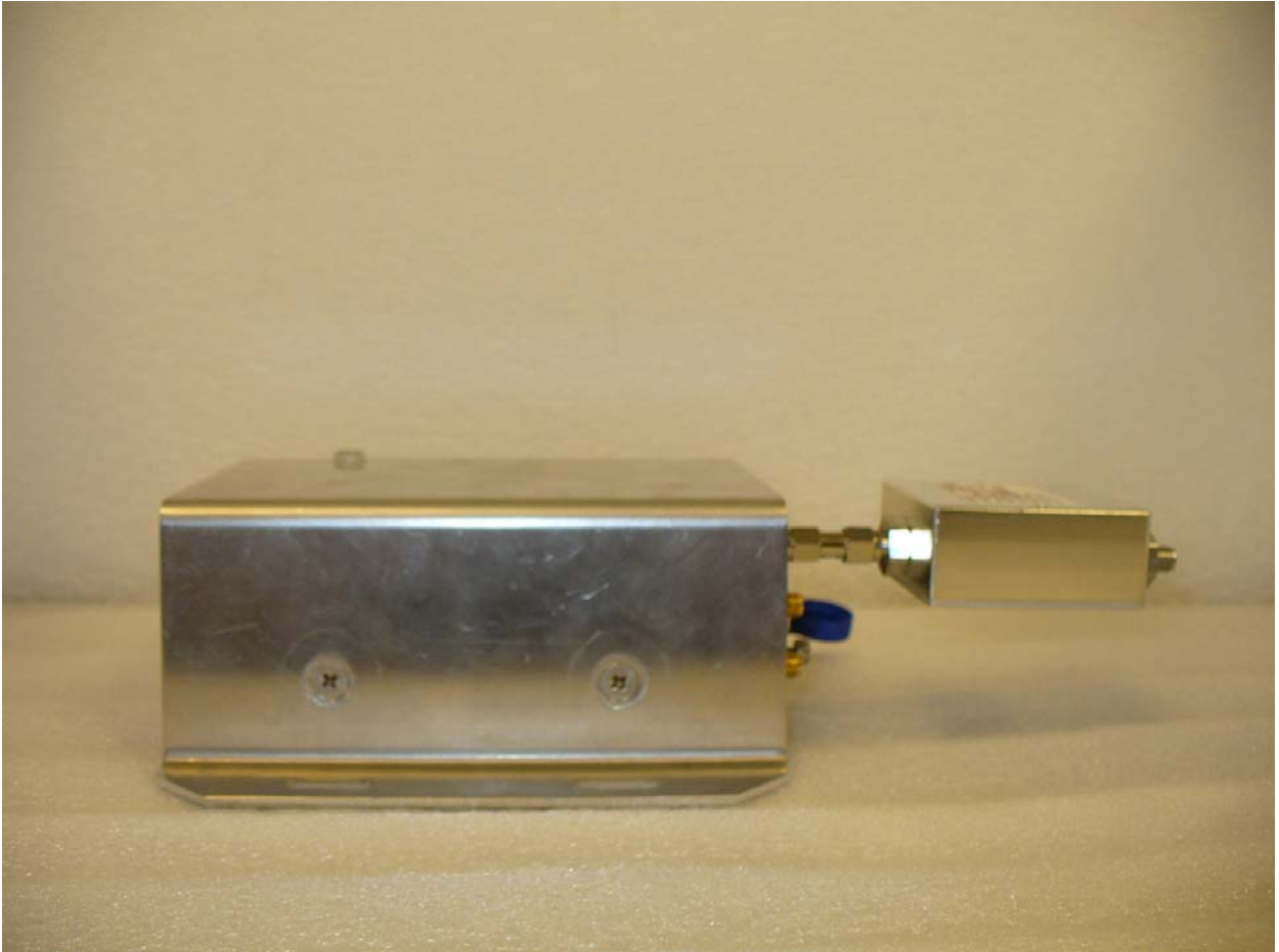
Figure 12: Left Side View (with Splitter)