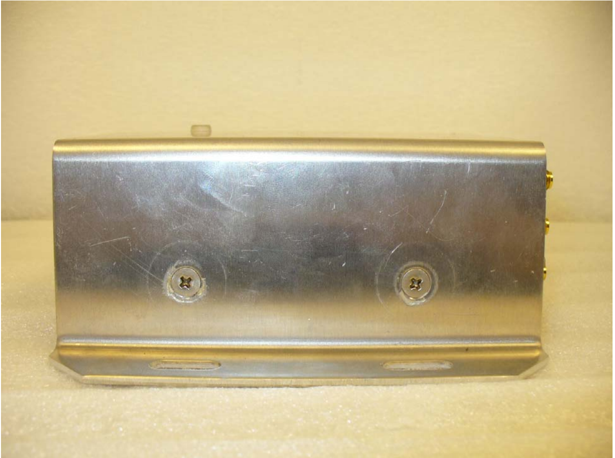
Figure 6: Left Side View