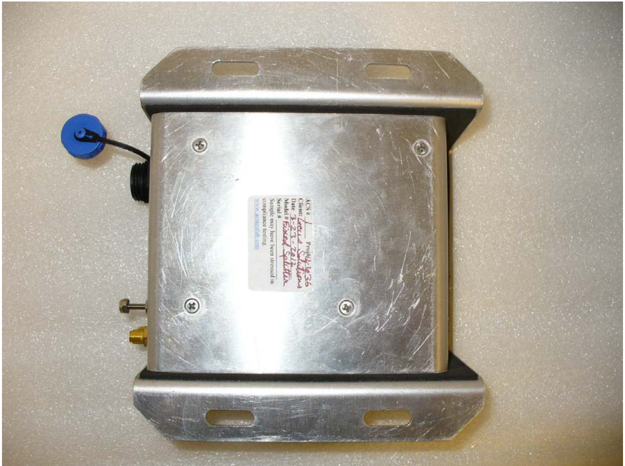
Figure 2: Bottom View