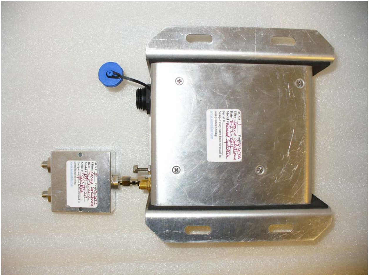
Figure 8: Bottom View (with Splitter)