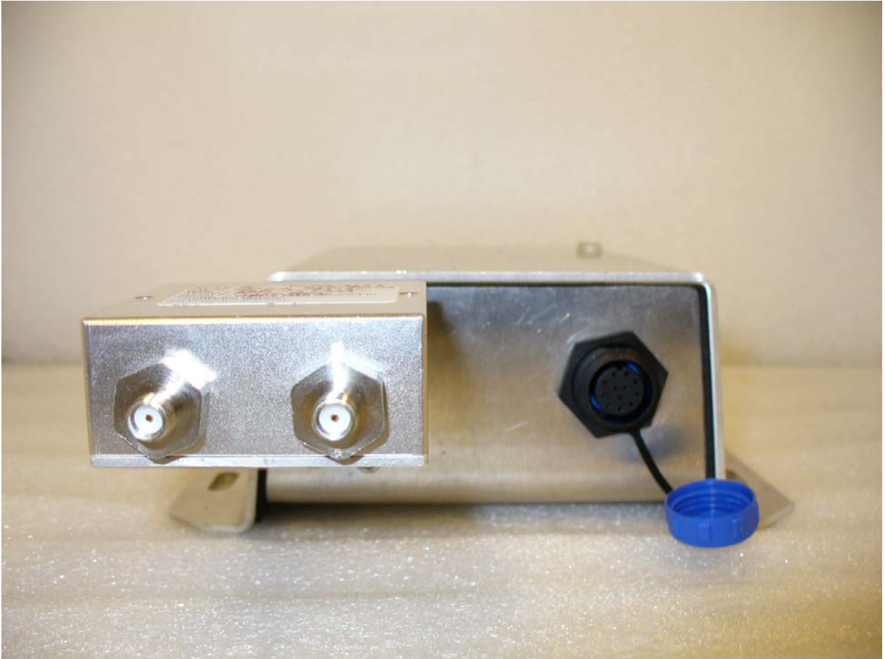
Figure 9: Front View (with Splitter)