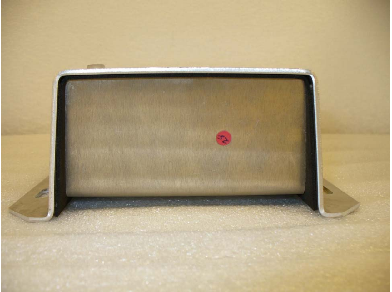
Figure 4: Rear View