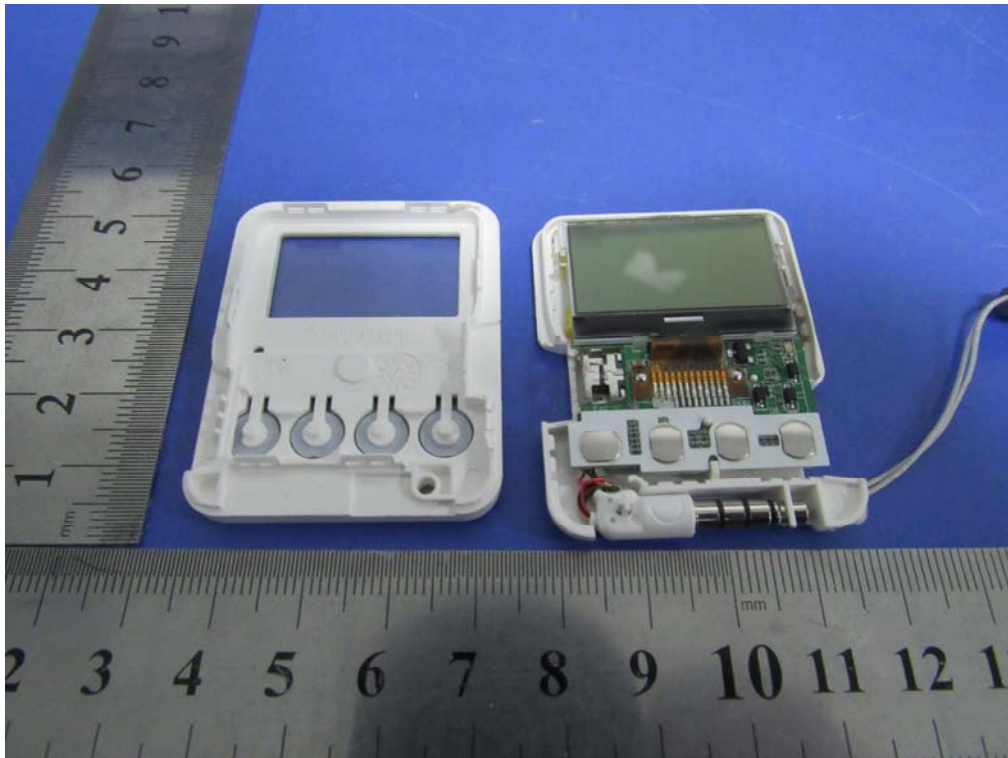
Uncover- Front View