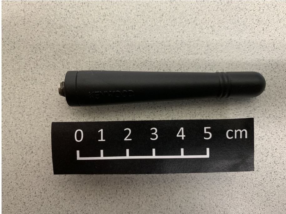
Antenna Model: KRA-23M, Length = 80mm (Antenna P/N T90-0798-x0)