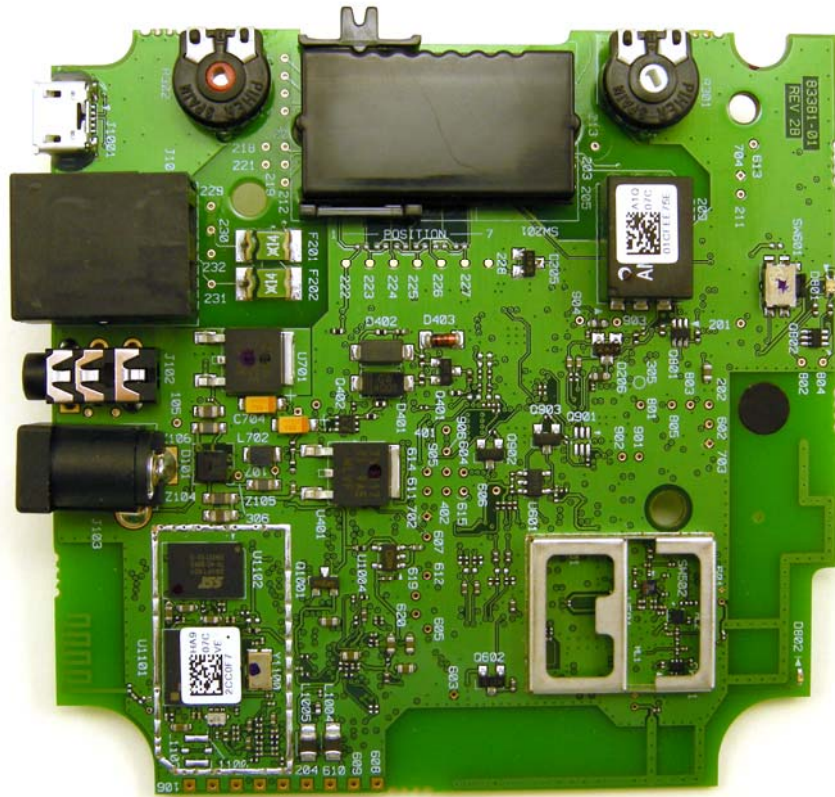
PCB Bottom No Shield