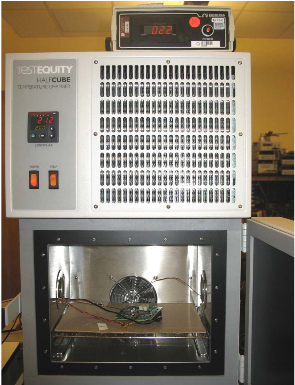
Fig. 39 - Base EUT within the temperature chamber, with RF connection to EUT and with power/control cable connection to EUT.