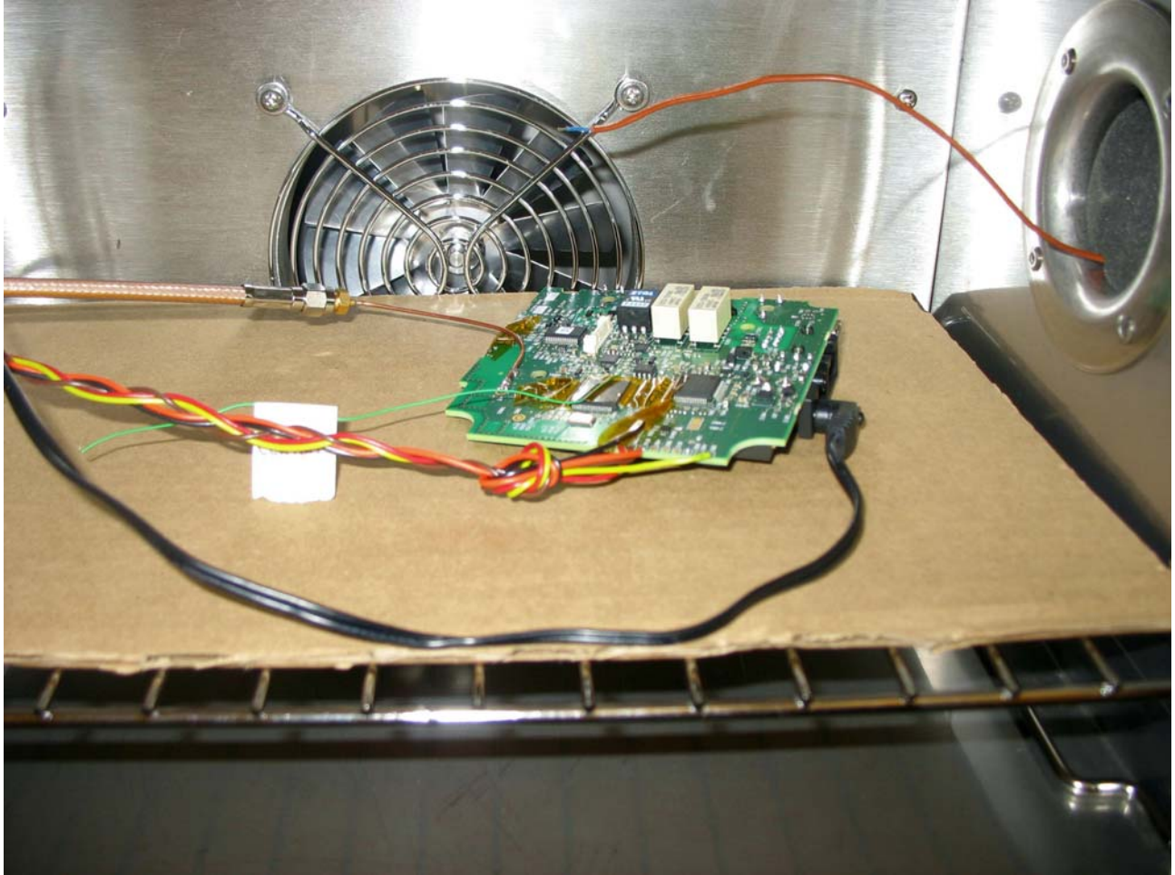
Fig. 40 - Detail of Base EUT as tested within the temperature chamber for the tests of clause 6.2.