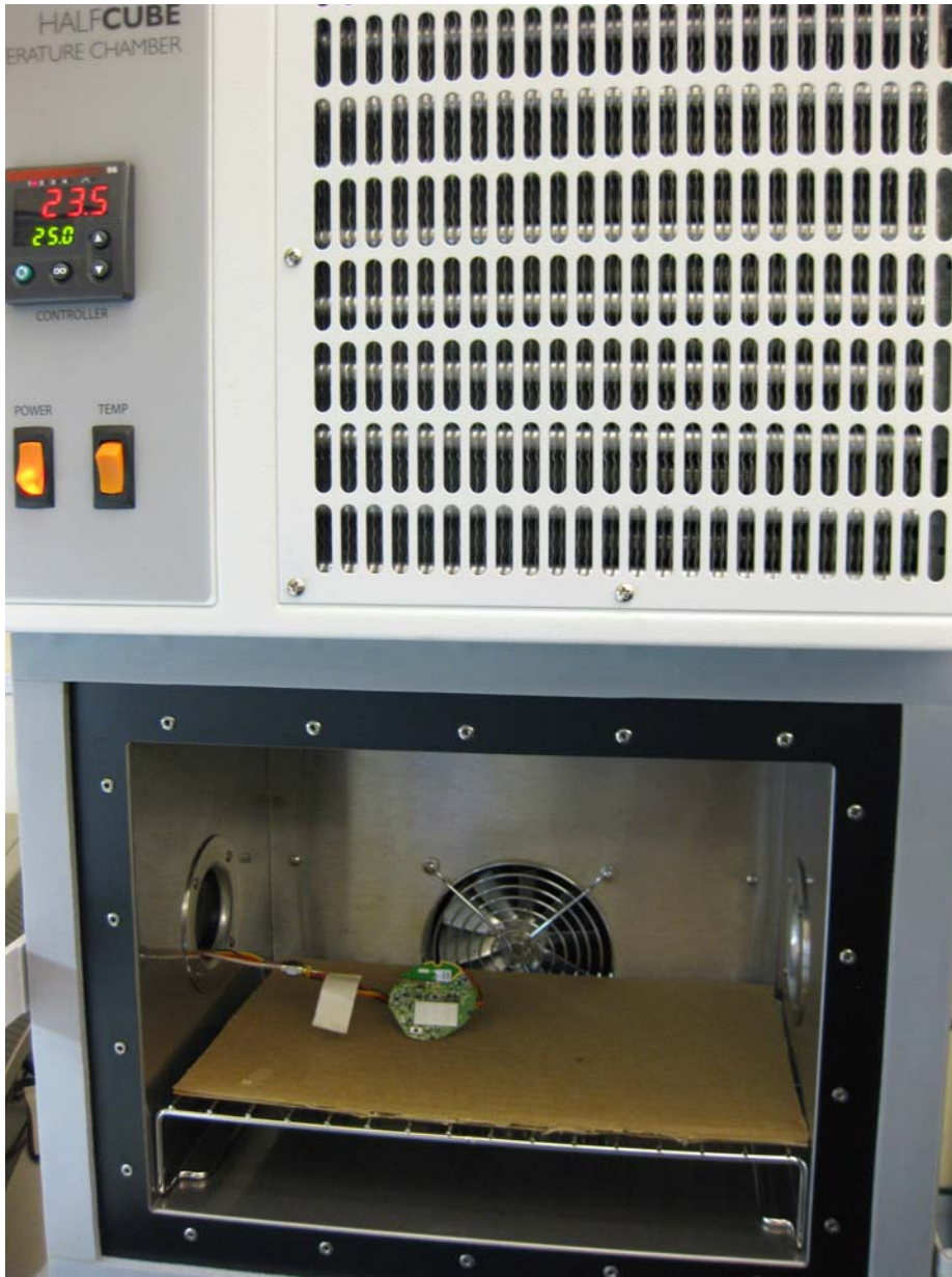
Fig. 39 - Headset EUT within the temperature chamber, with RF connection to EUT and with power/control cable connection to EUT.