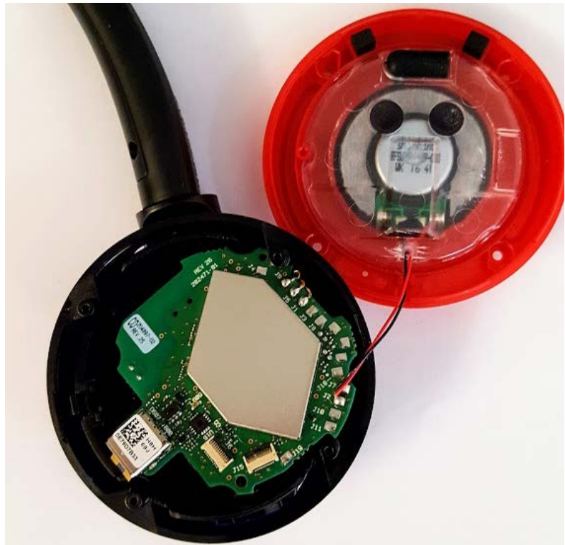
Top side picture PCBA