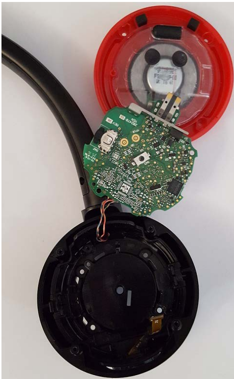
Bottom side picture PCBA