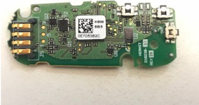
PCBA side B (no shield):