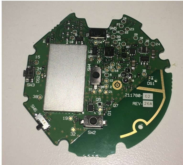
Right side PCB Top