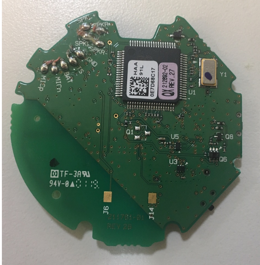
Right side PCB bottom