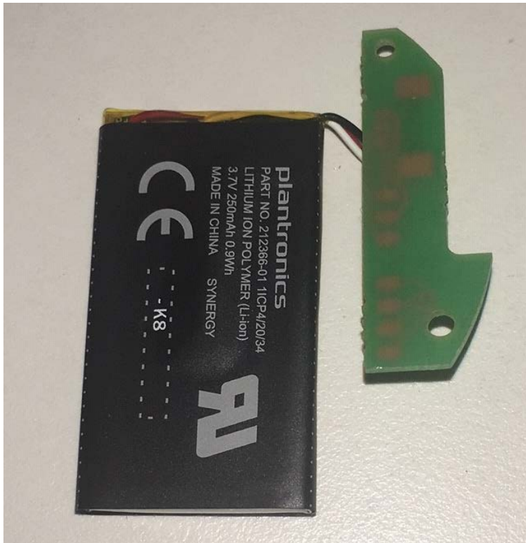
Left Side PCB with Battery Bottom