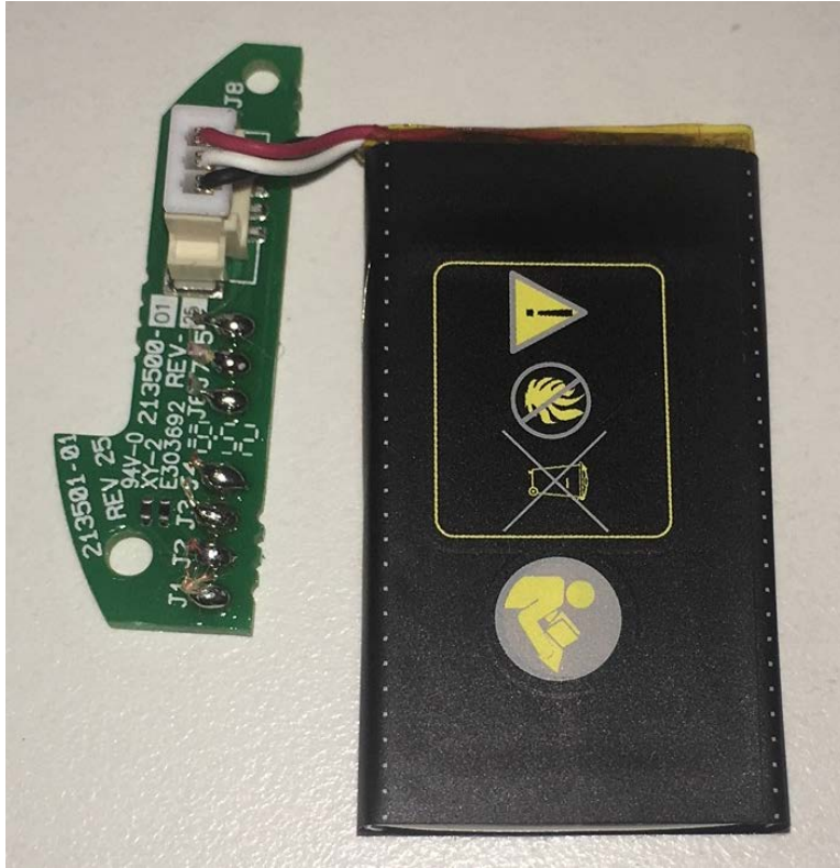
Left Side PCB with Battery Top