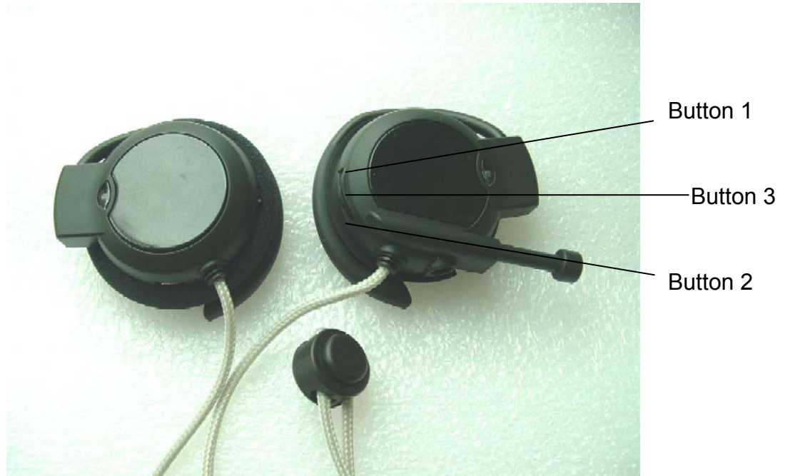
Figure 1. Bluetooth Stereo Headset