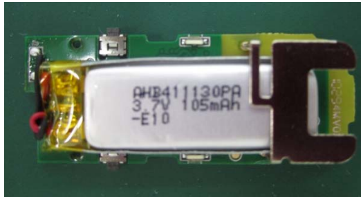
PCB Bottom (Battery Installed)