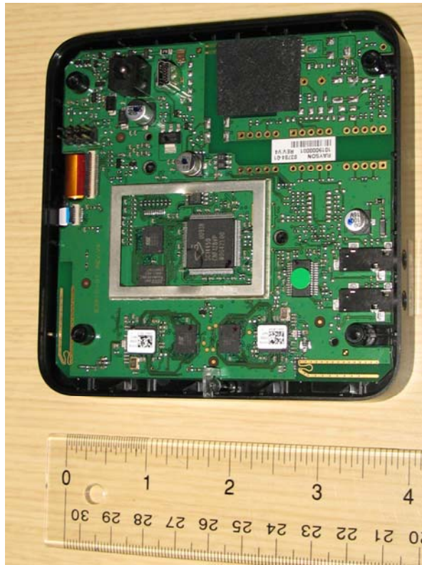
PCB Top No Shield