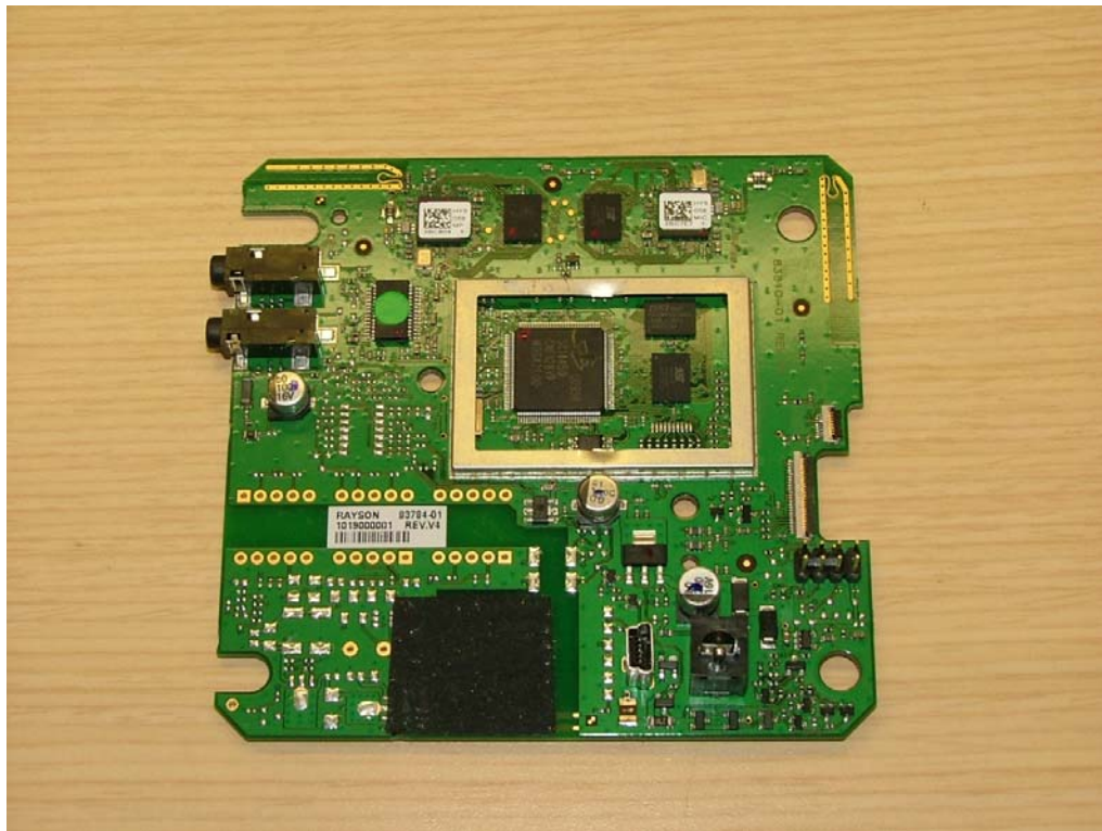
PCB Top No Shield