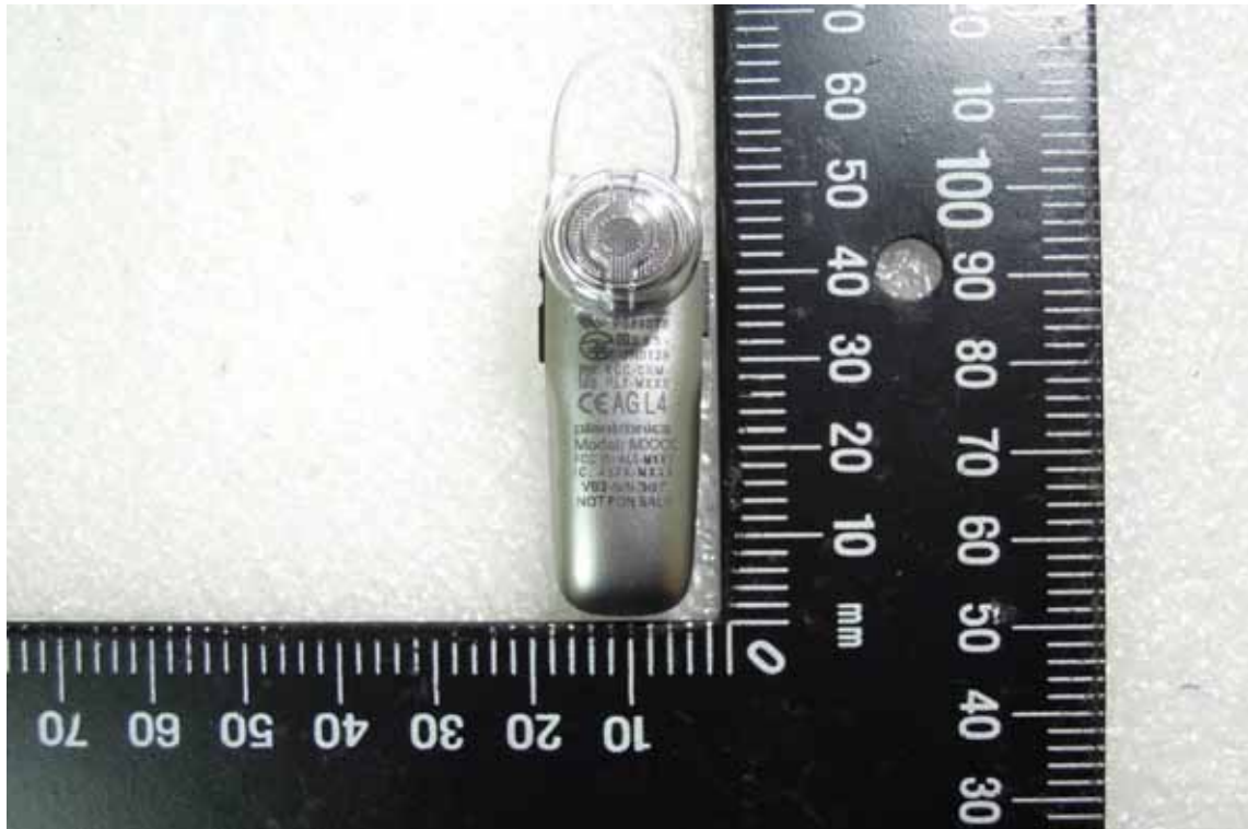
Side View of EUT - 1