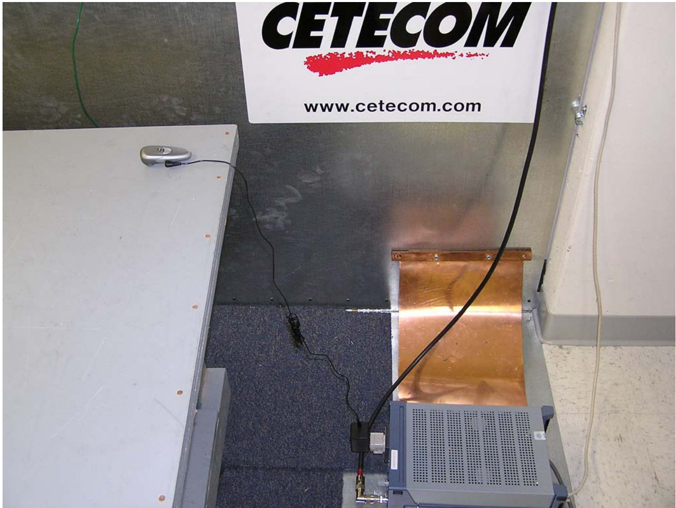
Test setup – AC Line Conducted Emissions