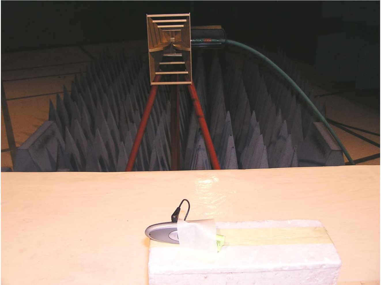
Test setup – Radiated Emissions